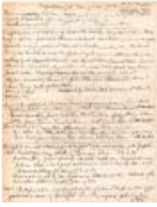
Certifications of Ch. Mem. of E. Soc. Folks (Coll. 003 Fold. 060 Doc. 014)