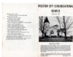
Preston City Congregational Church history pamphlet (undated) - at least 1966 (Coll. 003 Fold. 063 Doc. 019)