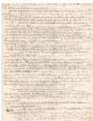
A Book of Record for the First Church in Preston Transcripts pg. 6 (Coll. 003 Fold. 061 Doc. 006)