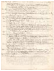
A Book of Record for the First Church in Preston Transcripts pg. 13 (Coll. 003 Fold. 061 Doc. 013)