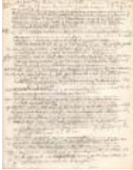
A Book of Record for the First Church in Preston Transcripts pg. 14 (Coll. 003 Fold. 061 Doc. 014)