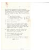
Preston City Congregational Church Response to Committee on Connecticut Congregational History - November 1965 (Coll. 003 Fold. 063 Doc. 021)