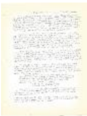
#113 Long Society and Long Society Church (Coll. 003 Vol. 002 Doc. 044)