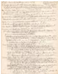
A Book of Record for the First Church in Preston Transcripts pg. 11 (Coll. 003 Fold. 061 Doc. 011)