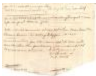
M. Hall's Notes on 20th Century Congregational Church History Fragment (Coll. 003 Fold. 063 Doc. 014)