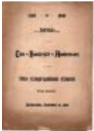
Services at the Two Hundredth Anniversary of the First Congregational Church (Coll. 003 Fold. 063 Doc. 028)