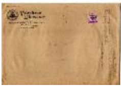
Rebuilding Long Society Church - 1817 & old papers (Coll. 003 Fold. 068 Doc. 001)