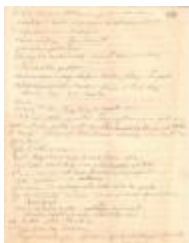
M. Hall Notes on Early Meeting Houses (Coll. 003 Fold. 063 Doc. 023)