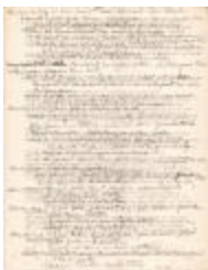
A Book of Record for the First Church in Preston Transcripts pg. 12 (Coll. 003 Fold. 061 Doc. 012)