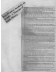
East Windsor Academy at Scantic,, A Museum of Local History (newspaper clipping) (2019.000.0112)