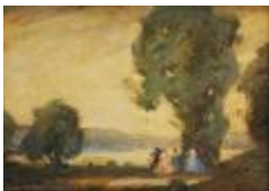
Untitled (Ladies at Lakeside Glen) (83.10)