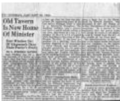
Newspaper Article - Old Tavern is now Home of Minister (2019.000.0138)