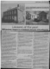
Lessons of the past-East Windsor Society hopes to refurbish historic schoolhouse. Article from the Journal Inquirer, dated April 14, 1998. (2019.000.0131)