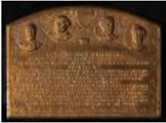
Plaque commemorating the 121st birthday of Capt John Ericsson (2021.018.044)