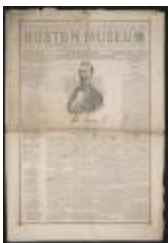
Newspaper: Boston Museum Newspaper, October 27, 1849 (T 2016.053.001)