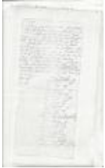
Photocopy of Subscription for Boston (Coll. 002 Fold. 008 Doc. 002)