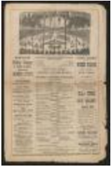
Advertisement: Ad for P.T. Barnum's Hippodrome at Back Bay in Boston (BF 1994.007.002)