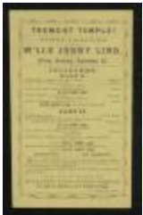
Program: Program for "First Concert of M'lle Jenny Lind" at Tremont Temple, Boston (T 2016.033.001)