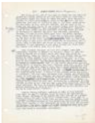
#107 Edwin Benjamin (Coll. 003 Vol. 002 Doc. 039)