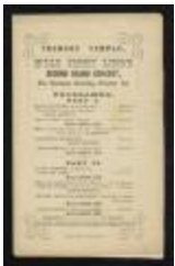
Program: Program for Jenny Lind's First and Second Grand Concerts at Tremont Temple, Boston (T 2016.034.001)