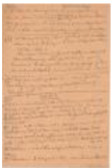
Notes on various families from Modern History of New London County (Coll. 003 Fold. 073 Doc. 011)