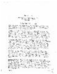
Preston Historical Society Newsletter Feb. 1974 (Coll. 003 Fold. 077 Doc. 021)