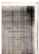
Copy of A Historic Discourse delivered at The Re-Dedication of the Long Society or Second Congregational Church, Preston, Conn. (Coll. 003 Fold. 068 Doc. 002)