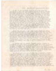
#69 Preston City Congregational Church (Coll. 003 Fold. 063 Doc. 020)