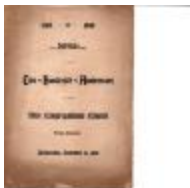
Services at the Two Hundredth Anniversary of the First Congregational Church (Coll. 003 Fold. 063 Doc. 028)