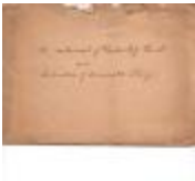
Bi-centennial of Preston City Church and Dedication of Monument & Library (Coll. 003 Fold. 060 Doc. 001)