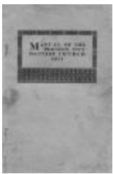
Manual of the Preston City Baptist Church 1911 (Coll. 003 Fold 054 Doc. 003)