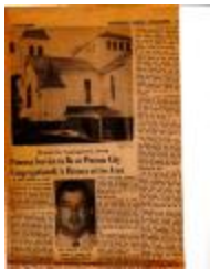
Pomona Service to Be at Preston City Congregational; A History of the Area (Coll. 003 Fold. 063 Doc. 022)