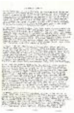
Baptist Church information (Coll. 003 Fold 054 Doc. 005)