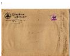
Rebuilding Long Society Church - 1817 & old papers (Coll. 003 Fold. 068 Doc. 001)