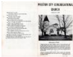
Preston City Congregational Church history pamphlet (undated) - at least 1966 (Coll. 003 Fold. 063 Doc. 019)