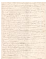
M. Hall Notes on Long Society - single page (Coll. 003 Fold. 068 Doc. 003)