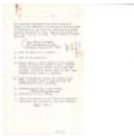
Preston City Congregational Church Response to Committee on Connecticut Congregational History - November 1965 (Coll. 003 Fold. 063 Doc. 021)