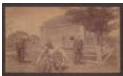
unidentified family and house (Photographs Fold. 003 Photo 072)