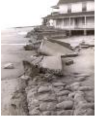
Hurricane of 1954-Fairfield Beach Damage (FF_Hurricane1954_004.tif)