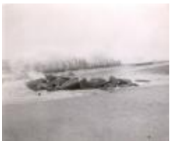
Hurricane of 1954 - Beach Dikes (FF_Hurricane1954_002)