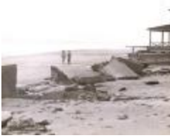
Hurricane of 1954-Fairfield Beach Aftermath (FF_Hurricane1954_003.tif)