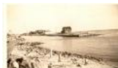
Hurricane of 1938 (FF_Hurricane1938_F1_002)