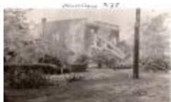
Hurricane of 1938 - Fairfield Trust Company (FF_Hurricane1938_F3_001)