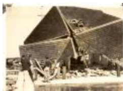
Hurricane of 1938 - Destroyed Home (FF_Hurricane1938_F1_001)