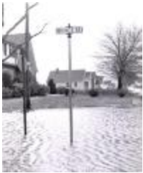
Quincy Street 1953 Hurricane (FF_Hurricane1953_F1_005)