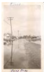
1938 Hurricane Reef Road flooded (FF_Hurricane1938_F1_028)