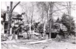
Hurricane of 1954-Clearing Rubble (FF_Hurricane1954_001)