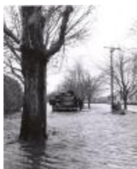
Hurricane of 1953 - Beach Road (FF_Hurricane1953_F1_001)