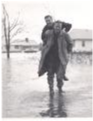
Hurricane of 1953 - Two Men in Floodwaters (FF_Hurricane1953_F1_002)