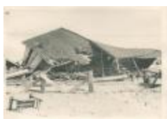
1938 Hurricane Collapsed Home at Beach (FF_Hurricane1938_F1_016)