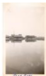
1938 Hurricane - Reef Road (FF_Hurricane1938_F1_018)