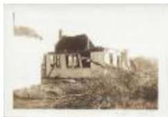
Photo Kimball School after Hurricane of 1938 (Coll. 002 Fold. 030 Photo 002)