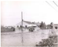
Hurricane of 1953 - Reef Road (FF_Hurricane1953_F1_004)