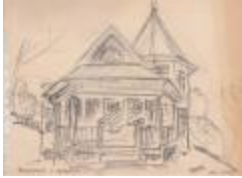
Original sketch "Preston Library" (Coll. 001 Fold. 013 Doc. 005)