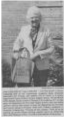
For Friends of the Library (Coll. 001 Fold. 006 Doc. 034)