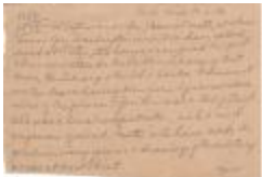
Gen. Samuel Mott (Coll. 003 Fold. 029 Doc. 011)