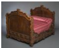
Furniture: Miniature bed made for Charles S. Stratton and M. Lavinia Warren (EL 1988.056.001)