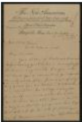
Letter: To M.A. Powers, from M. Lavinia Warren, November 5, 1901 (MS 0003.106.001)