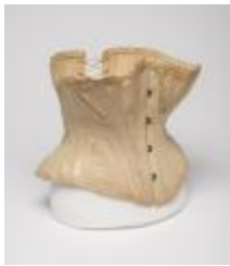
Textile: Corset belonging to M. Lavinia Warren (BF 1993.018.003 AB)