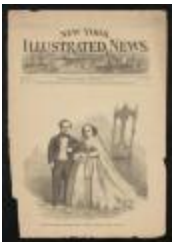
Newspaper: Cover illustration of New York Illustrated, featuring the Fairy Wedding, February 21, 1863 (1982.019.001)