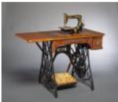
Textile equipment: Sewing machine owned by M. Lavinia Warren (2018.009.001)