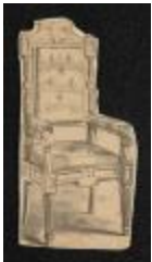
Toys and games: M. Lavinina Warren paper doll, arm chair (2003.009.062 I)