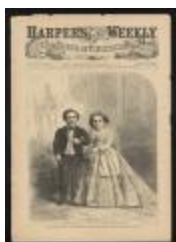
Newspaper: Cover and article from Harper's Weekly for February 21, 1863, featuring the Fairy Wedding (BF 1990.009.001-005)