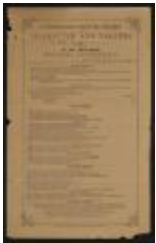
Document: Phrenology chart for M. Lavinia Warren, 1871 (MS 0003.117.001)