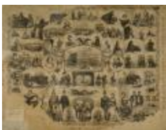
Poster: "Barnum's American Museum, Performance Three Times Daily, [Sun]rise till 10" (T 2014.025.001)