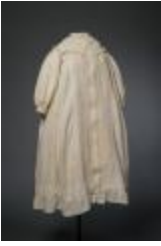
Textile: Nightgown belonging to M. Lavinia Warren (1976.001.008)