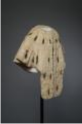
Textile: Fur cape belonging to M. Lavinia Warren (1976.001.035)