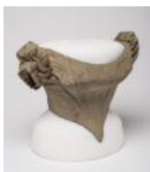
Textile: Bodice belonging to M. Lavinia Warren (T 2015.001.001)