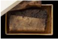
Souvenir: Boxed slice of Mr. and Mrs. Gen. Tom Thumb's wedding cake (2000.004.001 AC)