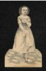
Toys and games: M. Lavinina Warren paper doll, figure in undergarments (2003.009.062 A)