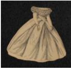
Toys and games: M. Lavinina Warren paper doll dresses in white and pink (EL 1988.107.001)