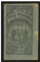
Book: "Tom Thumb's Three Years Tour Around the World" (front and back covers only) (EL 1988.086.001)