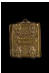
Jewelry: Fairy Wedding souvenir locket (BF 1995.019.001)