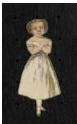
Toys and games: Minnie Warren paper doll, figure in undergarments (2003.009.062 H)