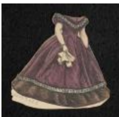
Toys and games: M. Lavinina Warren paper doll, burgundy dress (2003.009.062 C)