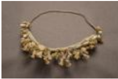
Textile: Bridal headpiece belonging to M. Lavinia Warren (T 2017.004.001)