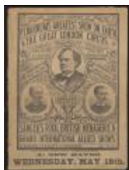
Courier: Advance Courier of Barnum's Greatest Show on Earth and the Great London Circus for May 18, 1881 (T 2015.055.001)