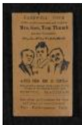
Ticket: Ticket for the Farewell Tour of Mrs. Gen. Tom Thumb and the Wonderful Liliputians (T 2016.025.001)