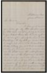
Letter: To P.T. Barnum from M. Lavinia Warren, June 12, 1878 (2003.009.013)