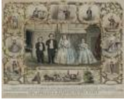
Print: "The Fairy Wedding" of General Tom Thumb (Charles S. Stratton) by Currier and Ives (T 2016.048.001)