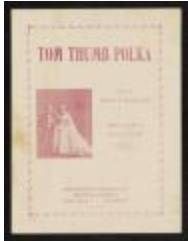
Sheet Music: "Tom Thumb Polka" with a "History of Mr. and Mrs. Tom Thumb" (EL 1988.153.001)