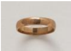
Jewelry: Lavinia Warren's Wedding Ring (1981.004.008)