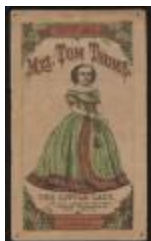
Toys and games: M. Lavinia Warren paper doll set (partial) with two dresses (EL 1988.106.001)