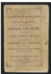
Book: "Sketch of the Life of General Tom Thumb and Lavinia Warren Stratton", 1867 (covers only) (T 2014.034.001)