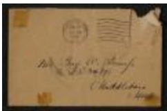
Letter: My dear brother and sister Edith from Sister Vinnie (M. Lavinia Warren), June 20, 1915 (MS 0003.106.002)