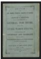
Book: "Sketch of the Life of General Tom Thumb and Lavinia Warren Stratton", 1867 (covers only) (T 2014.033.001)