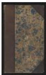
Book: "Tom Thumb's Three Years Tour Around the World" (inscribed copy) (EL 1988.087.001)