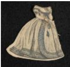
Toys and games: M. Lavinina Warren paper doll, white and blue dress (2003.009.062 F)