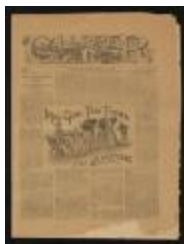
Newspaper: The Clipper with article about M. Lavinia Warren and Primo Magri (T 2016.020.001)