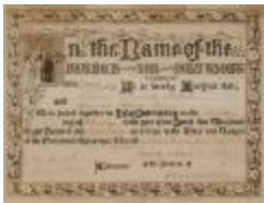
Document: "Marriage Certificate of Charles Stratton (General Tom Thumb) to Mercy Lavinia Warren Bump (Lavinia Warren)" (T 2013.036.001)