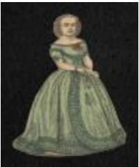
Toys and games: M. Lavinina Warren paper doll, figure wearing green dress (2003.009.062 B)