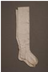
Textile: Pair of stockings belonging to M. Lavinia Warren (EL 1988.158.001 AB)