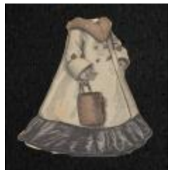
Toys and games: M. Lavinina Warren paper doll, winter coat with fur collar and muff (2003.009.062 G)