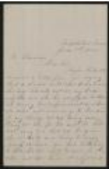
Letter: To P.T. Barnum from M. Lavinia Warren, June 5, 1878 (2003.009.035)