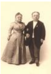
Lavinia Warren Stratton Magri and Count Primo Magri (POR_T3_Stratton_LaviniaW_01)