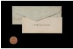
Physical object: Calling card for Mr. and Mrs. Charles S. Stratton (T 2016.026.001 AB)