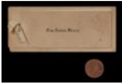
Calling card: Dual calling card for Miss Lavinia Warren and Charles S. Stratton (1981.002.001)