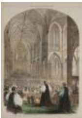
Newspaper: "The Fairy Wedding - The Marriage Ceremony of Charles S. Stratton (Gen. Tom Thumb) and Miss Lavinia Warren (the Queen of Beauty)", Frank Leslie's Illustrated, color version (T 2013.011.001)