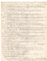
A Book of Record for the First Church in Preston Transcripts pg. 4 (Coll. 003 Fold. 061 Doc. 004)