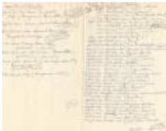
Brewster baptism church records - Marion Hall Notes (Coll. 003 Fold. 008 Doc. 009)