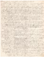
A Book of Record for the First Church in Preston Transcripts pg. 5 (Coll. 003 Fold. 061 Doc. 005)