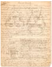
A Book of Record for the First Church in Preston Transcripts pg. 1 (Coll. 003 Fold. 061 Doc. 001)