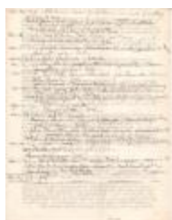
A Book of Record for the First Church in Preston Transcripts pg. 13 (Coll. 003 Fold. 061 Doc. 013)