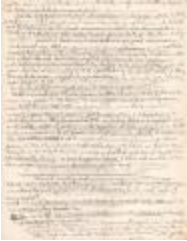
A Book of Record for the First Church in Preston Transcripts pg. 6 (Coll. 003 Fold. 061 Doc. 006)