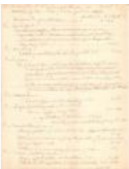
M. Hall's Notes from col. VI of Preston City Congregational Church Records (Coll. 003 Fold. 063 Doc. 025)