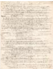
A Book of Record for the First Church in Preston Transcripts pg. 7 (Coll. 003 Fold. 061 Doc. 007)