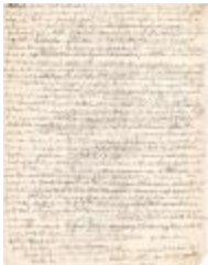
A Book of Record for the First Church in Preston Transcripts pg. 2 (Coll. 003 Fold. 061 Doc. 002)