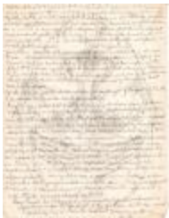
A Book of Record for the First Church in Preston Transcripts pg. 3 (Coll. 003 Fold. 061 Doc. 003)