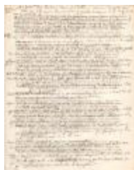
A Book of Record for the First Church in Preston Transcripts pg. 14 (Coll. 003 Fold. 061 Doc. 014)