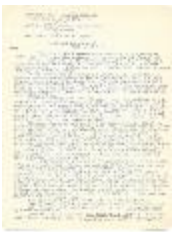
Semi-Centennial Historical Discourse (Coll. 003 Fold. 039 Doc. 001)