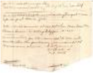
M. Hall's Notes on 20th Century Congregational Church History Fragment (Coll. 003 Fold. 063 Doc. 014)