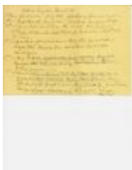
Seats in Long Society Church 1760 (Coll. 003 Fold. 068 Doc. 005)