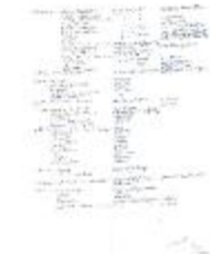
Church Membership - Preston City Congregational Church 1697 - 1976 (Coll. 003 Fold. 059 Doc. 002)