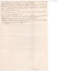
A Book of Record for the First Church in Preston Transcripts pg. 9 (Coll. 003 Fold. 061 Doc. 009)