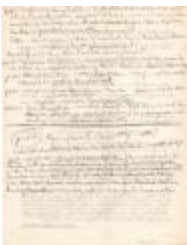
A Book of Record for the First Church in Preston Transcripts pg. 10 (Coll. 003 Fold. 061 Doc. 010)