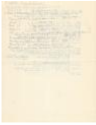
Bowdish records (Coll. 003 Fold. 053 Doc. 011)