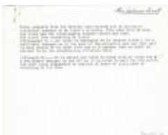
Rev. Salmon Treat - extracts from Town Records (Coll. 003 Fold. 046 Doc. 007)