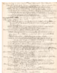
A Book of Record for the First Church in Preston Transcripts pg. 12 (Coll. 003 Fold. 061 Doc. 012)