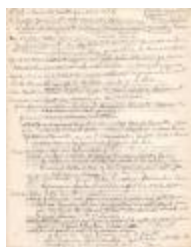
A Book of Record for the First Church in Preston Transcripts pg. 11 (Coll. 003 Fold. 061 Doc. 011)