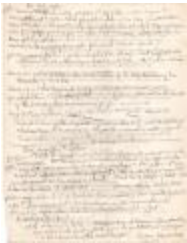
A Book of Record for the First Church in Preston Transcripts pg. 8 (Coll. 003 Fold. 061 Doc. 008)