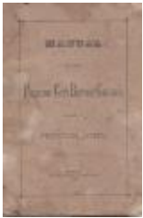
Manual of the Preston City Baptist Church 1885 (Coll. 003 Fold 054 Doc. 006)