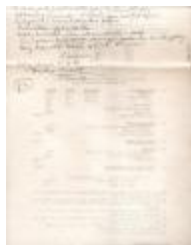
A Book of Record for the First Church in Preston Transcripts pg. 33 (Coll. 003 Fold. 061 Doc. 017)