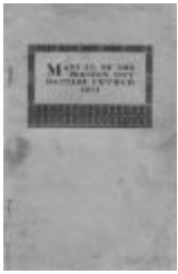
Manual of the Preston City Baptist Church 1911 (Coll. 003 Fold 054 Doc. 003)