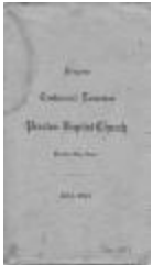
Preston Baptist Church Centennial Exercises Program (Coll. 003 Fold 054 Doc. 004)