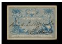
Ticket: Ticket to Barnum's American Museum (2001.004.001)