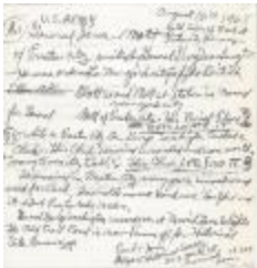
Notes on General James Mott (Coll. 002 Fold. 026 Doc. 023)