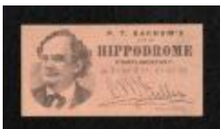
Ticket: Complimentary ticket to "P.T. Barnum's Roman Hippodrome" on pale orange card stock (E1 1988.022.003)