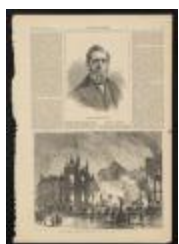
Newspaper: Harper's Weekly for January 11, 1873 with illustration entitled "The Burning of Barnum's Hippodrome" (BF 1993.017.009.004)