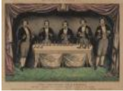
Print: "The Lancashire Bell Ringers," No. 4 in Barnum's Gallery of Wonders by Currier and Ives" (T 2013.037.001)