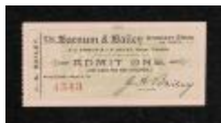
Ticket: Complimentary ticket to "The Barnum & Bailey Greatest Show on Earth" from J. A. Bailey (1998.014.001)