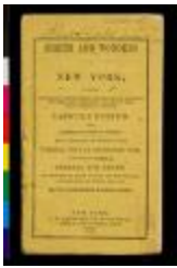
Booklet: "Sights and Wonders in New York" (T 2014.023.001)