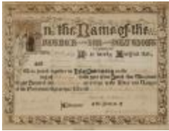
Document: "Marriage Certificate of Charles Stratton (General Tom Thumb) to Mercy Lavinia Warren Bump (Lavinia Warren)" (T 2013.036.001)