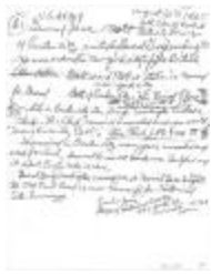
Photocopy of Note on General James Mott (Coll. 002 Fold. 018 Doc. 024)