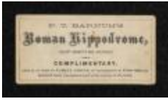
Ticket: Complimentary ticket to "P. T. Barnum's Roman Hippodrome" (EL 1988.022.005)