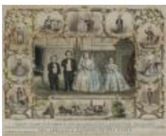
Print: "The Fairy Wedding" of General Tom Thumb (Charles S. Stratton) by Currier and Ives (T 2016.048.001)