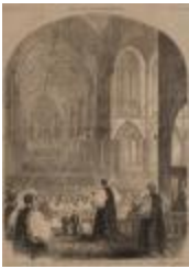
Newspaper: "The Fairy Wedding - The Marriage Ceremony of Charles S. Stratton (Gen. Tom Thumb) and Miss Lavinia Warren (The Queen of Beauty)" from Frank Leslie's Illustrated Newspaper (black and white) (EL 1988.076.001)