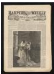
Newspaper: Uncut edition of Harper's Weekly, April 14, 1866, with illustration of the Grand Masquerade Ball. (2015.005.001)