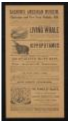
Advertisement: Handbill for "Barnum's American Museum, Christmas and New Year Holiday Bill" (T 2014.024.001)