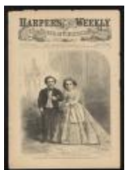
Newspaper: Cover and article from Harper's Weekly for February 21, 1863, featuring the Fairy Wedding (BF 1990.009.001-005)