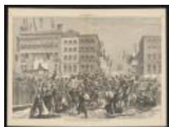
Newspaper: Centerfold of Harper's Weekly, "View of Broadway, Opposite Fulton Street, New York," with Barnum's American Museum in the background, Feb. 1860 (2015.008.001)