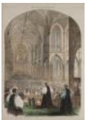
Newspaper: "The Fairy Wedding - The Marriage Ceremony of Charles S. Stratton (Gen. Tom Thumb) and Miss Lavinia Warren (the Queen of Beauty)", Frank Leslie's Illustrated, color version (T 2013.011.001)