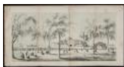
Print: "Castle-Garden, New York, 1852" (2012.010.001)