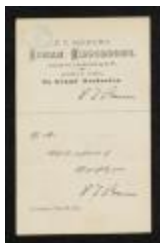
Ticket: "Complimentary ticket to P.T. Barnum's Roman Hippodrome, June 27, 1874" (2003.009.036)