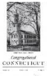
Congregational Connecticut, May 1938, Volume III, Number 5 (Coll. 003 Fold. 073 Doc. 031)