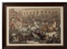
Print: "Sleighing in New York" (2015.010.001)