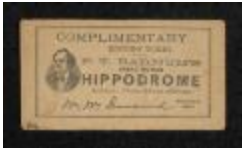
Ticket: Complimentary Editor's Ticket to "P. T. Barnum's Great Roman Hippodrome" (EL 1988.022.004)