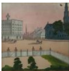
Physical object: Clock component, Painted glass panel from mantel clock, "View in Broadway, New York" (2015.009.001)