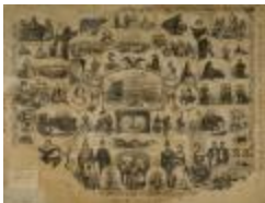
Poster: "Barnum's American Museum, Performance Three Times Daily, [Sun]rise till 10" (T 2014.025.001)