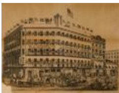
Print: "Barnum's American Museum" (T 2012.001.001)