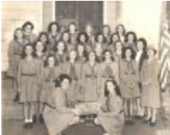
Washington School Girl Scouts (FF_Schools_Elementary_Washington_005)