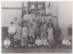
unidentified children group (Photographs Fold. 003 Photo 070-2)