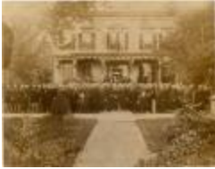
841 Old Post Road (FF_BLDGS_841Old Post Rd_3)