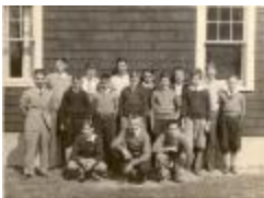
Bridgeport Star Newsboys (POR_S30_Simmons_Joseph_01)