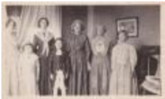
unidentified costumed group (1 February 1978) (Photographs Fold. 007 Photo 153)