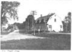
Treat Store (Coll. 003 Vol. 015 Photo 015b)