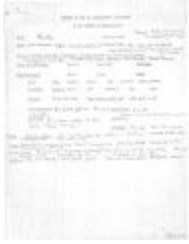
Census of Old or Distinctive Buildings in the State of Connecticut - Preston Mott Home (Coll. 002 Fold. 028 Doc. 010)