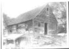
Stafford's Mill (Coll. 003 Vol. 015 Photo 43b)