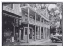
print, photographic (2007.01.217)