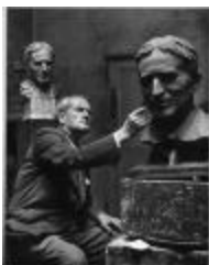
Portrait of James Earle Fraser in his Studio (221)