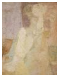
The Sisters (X68.175)