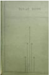
Scrapbook about WWII Jamaican Laborers (M38.Scovill.002)