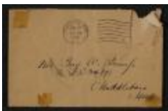
Letter: My dear brother and sister Edith from Sister Vinnie (M. Lavinia Warren), June 20, 1915 (MS 0003.106.002)