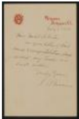
Letter: To Miss Mabel Porter from P.T. Barnum, July 8, 1886 (BM-MSS 002 S01 B01F06)