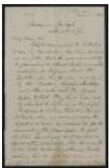
Letter: Dear sir from P.T. Barnum, March 2, 1860 (BM-MSS 002 S01 B01F04)