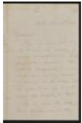
Letter: To P.T. Barnum from O.W. Holmes, December 15, 1853 (2003.009.040)