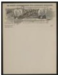
Stationery: Barnum and Bailey Greatest Show on Earth letterhead, circa 1900s (MS 0004.106.002)