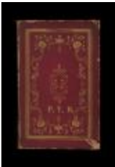
Physical object: Illustrated blank journal owned by P. T. Barnum (2007.002.027)