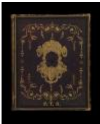
Physical object: Illustrated blank journal owned by P. T. Barnum (T 2015.041.001)