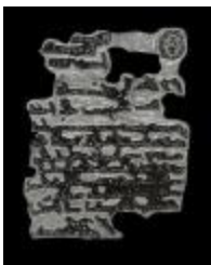
Physical object: Stereotype printing plate of P. T. Barnum letter (2008.003.001)