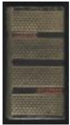
Document: P. T. Barnum's address book (EL 1989.012.001)