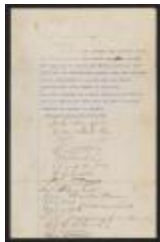
Document: Winter Quarters Petition, November 23, 1887 (MS 0004.114.001)