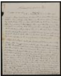
Letter: My dear Greenwood from P.T. Barnum, October 10, 1855 (BM-MSS 002 S01 B01F03)