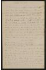
Letter: To Honorable Wildman from P.T. Barnum, May 17, 1883 (BM-MSS 002 S01 B01F02 item 01)