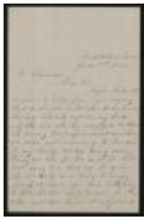
Letter: To P.T. Barnum from M. Lavinia Warren, June 5, 1878 (2003.009.035)