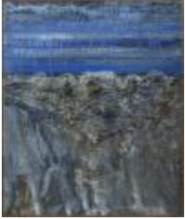
Blue Landscape (0049)