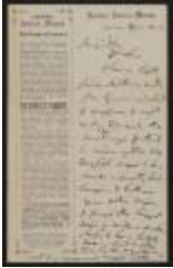
Letter: To B.P. Cilley from P.T. Barnum, December 14, 1861 (BM-MSS 002 S01 B01F04)