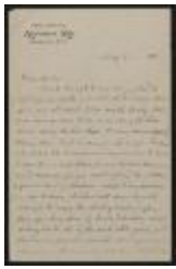
Letter: Dear Helen from P.T. Barnum, August 8, 1890 (BM-MSS 002 S01 B01F07)