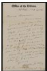
Letter: To Friend Barnum from Horace Greeley, May 27, 1867 (2003.009.034)