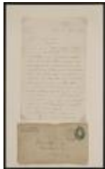
Letter: To the Hyde Brothers from P.T. Barnum, September 17, 1889 (BM-MSS 002 S01 B01F06)