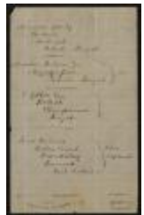
Document: Note written by P.T. Barnum regarding elephants, February 20, 1882 (2003.009.017)