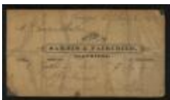
Document: Receipt to Charles S. Stratton from Sammis & Fairchild Clothiers, 1872 (EL 1988.277.001)