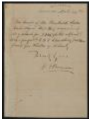
Letter: To Unknown recipient from P.T. Barnum, August 24, 1885 (2015.007.001)