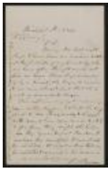
Letter: To W.C. Curry from P.T. Barnum, March 21, 1862 (BM-MSS 002 S01 B01F04)