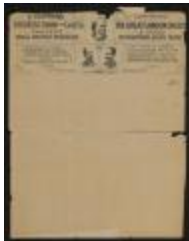
Stationery: Barnum and Bailey Greatest Show on Earth letterhead, circa 1880s (MS 0004.106.001)