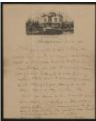
Letter: Dear sir from P.T. Barnum, December 26, 1865 (BM-MSS 002 S01 B01F04)