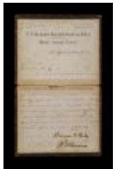
Letter: Souvenir Contract with P. T. Barnum & Co., 1888 (2007.002.050)