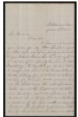
Letter: To P.T. Barnum from M. Lavinia Warren, June 12, 1878 (2003.009.013)