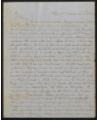
Letter: To P.T. Barnum from Rembrandt Peale, October 25, 1851 (2003.009.077)