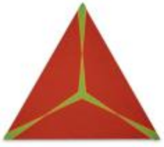
Raja (Red and Yellow) (0048)