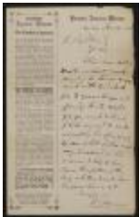
Letter: To B.P. Cilley from P.T. Barnum, November 20, 1861 (BM-MSS 002 S01 B01F04)