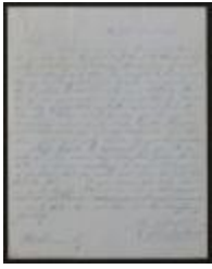
Letter: To P.T. Barnum from C. VanDerbilt, December 6, 1850 (2003.009.042)