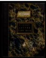
Document: P.T. Barnum Letter Copybook, 1845 - 1846 (2004.002.001)