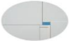
Oval Blue (0052)