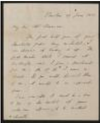
Letter: To P.T. Barnum from Edward Everett, June 27, 1853 (2003.009.039)