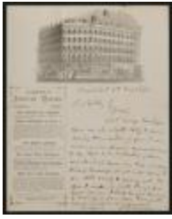
Letter: To B. P. Cilley from P.T. Barnum, July 22, 1861 (BM-MSS 002 S01 B01F04)