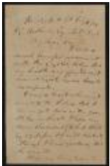
Letter: To I.E. Williams from P.T. Barnum, July 14, 1854 (includes typescript copy) (BM-MSS 002 S01 B01F03)