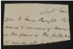
Letter: Paper scrap signed by P.T. Barnum underneath additional script (BM-MSS 002 S01 B01F08)