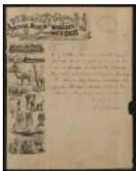
Letter: To Editor from P.T. Barnum, February 3, 1872 (BM-MSS 002 S01 B01F05)