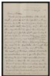
Letter: To Friend Wildman from P.T. Barnum, July 16, 1886 (BM-MSS 002 S01 B01F06)