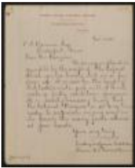
Letter: To P.T. Barnum from S. Baird, Director of the Smithsonian, November 12, 1885 (2003.009.038)