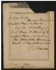
Letter: Mr Raider[?] from P.T. Barnum, October 2[?] 1877 (BM-MSS 002 S01 B01F05)