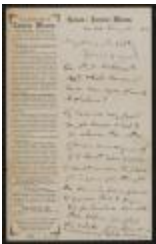
Letter: B.P. Cilley from P.T. Barnum, [?] 16, 1862 (BM-MSS 002 S01 B01F04)