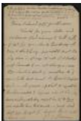
Letter: To beloved old gentleman from P.T. Barnum, June 4, 1890 (BM-MSS 002 S01 B01F07)