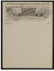
Stationery: Barnum and Bailey Greatest Show on Earth letterhead (EL 1988.418.001)