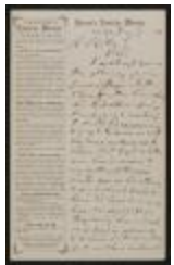
Letter: To B.P. Cilley from P.T. Barnum, January 7, 1862 (BM-MSS 002 S01 B01F04)