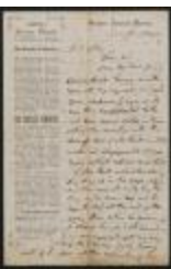
Letter: To B.P. Cilley from P.T. Barnum, March 26, 1861 (BM-MSS 002 S01 B01F04)