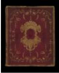
Physical object: Illustrated blank journal owned by P. T. Barnum (T 2015.040.001)