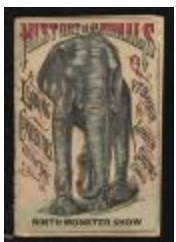
Booklet: "History of Animals and Leading Curiosities . . ." featuring Jumbo on cover (T 2014.045.001)