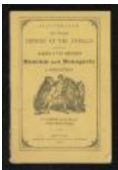
Booklet: "Illustrated and Descriptive History of the Animals..." with lion tamer on cover (T 2016.031.001)