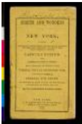
Booklet: "Sights and Wonders in New York" (T 2014.023.001)