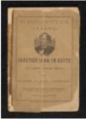
Book: Circus Route Book for 1883 (2003.009.025)