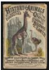
Booklet: "History of the Animals and Leading Curiosities . . ." with giraffe on cover (T 2016.032.001)