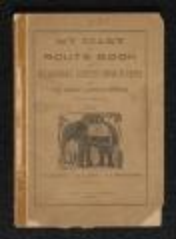
Book: "Circus Route Book for 1882" (2003.009.026)