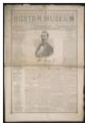
Newspaper: Boston Museum Newspaper, October 27, 1849 (T 2016.053.001)