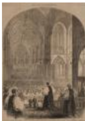
Newspaper: "The Fairy Wedding - The Marriage Ceremony of Charles S. Stratton (Gen. Tom Thumb) and Miss Lavinia Warren (The Queen of Beauty)" from Frank Leslie's Illustrated Newspaper (black and white) (EL 1988.076.001)