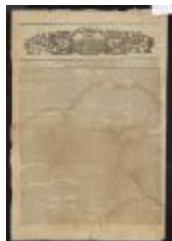
Newspaper: Herald of Freedom and Gospel Witness, Vol. II, New Series 11, December 26, 1832 (1998.010.004 AB)