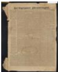
Newspaper: Bridgeport Messenger, Vol. I, No. 52, November 21, 1832 (1998.010.002)