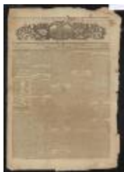
Newspaper: Herald of Freedom and Gospel Witness, Vol. II, New Series 1, October 17, 1832 (1998.010.010 AB)