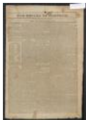
Newspaper: Herald of Freedom Vol. I No. 52, October 10, 1832 (1998.010.011 AB)