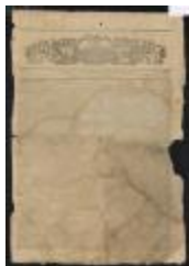
Newspaper: Herald of Freedom and Gospel Witness, Vol. II, New Series 12, January 2, 1833 (1998.010.003 AB)