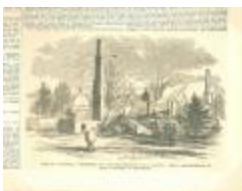
Newspaper: Clipping featuring illustration of "Ruins of 'Iranistan'" (2003.009.076)