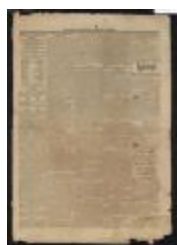
Newspaper: Herald of Freedom and Gospel Witness, November 7, 1832 (1998.010.008)