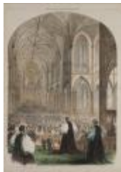
Newspaper: "The Fairy Wedding - The Marriage Ceremony of Charles S. Stratton (Gen. Tom Thumb) and Miss Lavinia Warren (the Queen of Beauty)", Frank Leslie's Illustrated, color version (T 2013.011.001)