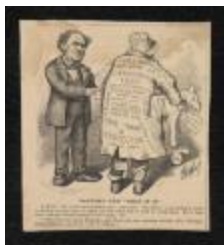
Illustration: "NY Tribune political cartoon by Thomas Nast, titled "'Barnum's New 'What Is It''" (T 2016.018.001)