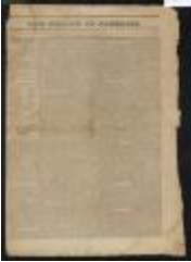
Newspaper: Herald of Freedom, Vol. I, No. 48, September 12, 1832 (1998.010.013 AB)