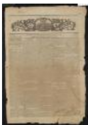
Newspaper: Herald of Freedom and Gospel Witness, Vol. II, New Series 10, December 19, 1832 (1998.010.005 AB)