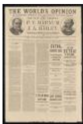
Newspaper: "The World's Opinion As Expressed Through the Columns of the Daily Press" (2003.009.107)