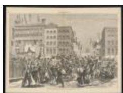
Newspaper: Centerfold of Harper's Weekly, "View of Broadway, Opposite Fulton Street, New York," with Barnum's American Museum in the background, Feb. 1860 (2015.008.001)