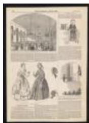
Newspaper: Article from Illustrated London News, February 24, 1844, about Charles S. Stratton's (General Tom Thumb) performance (T 2016.021.001)