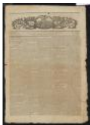
Newspaper: Herald of Freedom and Gospel Witness, Vol. II, New Series 9, December 12, 1832 (1998.010.006 AB)