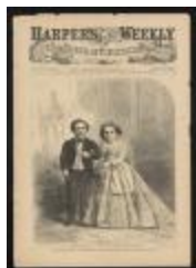
Newspaper: Cover and article from Harper's Weekly for February 21, 1863, featuring the Fairy Wedding (BF 1990.009.001-005)