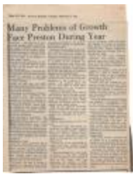
Many Problems of Growth Face Preston During Year (Coll. 002 Fold. 026 Doc. 026)