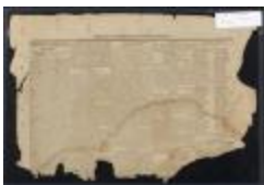
Newspaper: Fragment of Herald of Freedom and Gospel Witness, January 3, 1833 (1998.010.017)