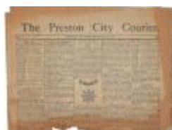
The Preston City CourierVol. X No. 3 (Coll. 001 Fold. 023 Doc. 001)