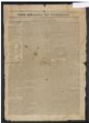
Newspaper: Herald of Freedom, Vol. I, No. 46, August 29, 1832 (1998.010.015 AB)