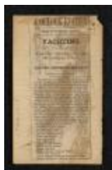
Newspaper: Article "Yachting" from Brooklyn Eagle listing Capt. Stratton (General Tom Thumb) (T 2016.019.001)