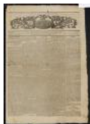
Newspaper: Herald of Freedom and Gospel Witness, Vol. II, New Series 3, October 31, 1832 (1998.010.009 AB)