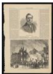
Newspaper: Harper's Weekly for January 11, 1873 with illustration entitled "The Burning of Barnum's Hippodrome" (BF 1993.017.009.004)