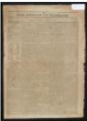
Newspaper: Herald of Freedom, Vol. I, No. 47, September 5, 1832 (1998.010.014 AB)