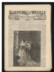
Newspaper: Uncut edition of Harper's Weekly, April 14, 1866, with illustration of the Grand Masquerade Ball. (2015.005.001)