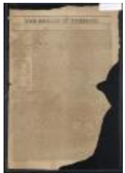
Newspaper: Herald of Freedom Vol. I, No. 50, September 26, 1832 (1998.010.016 AB)