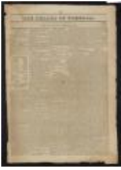
Newspaper: Herald of Freedom, Vol. I, No 49, September 19, 1832 (1998.010.012 AB)