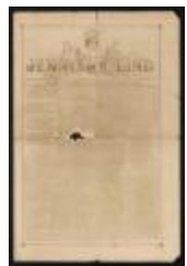
Newspaper: Promotional Newspaper for Jenny Lind (T 2016.016.001)