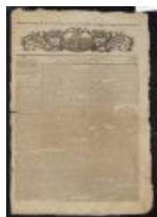
Newspaper: Herald of Freedom and Gospel Witness, Vol. II, New Series 8, December 5, 1832 (1998.010.007 AB)