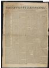
Newspaper: Connecticut Repository, Vol. I, No. 33, October 24, 1832 (1998.010.001 AB)