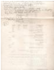
A Book of Record for the First Church in Preston Transcripts pg. 33 (Coll. 003 Fold. 061 Doc. 017)