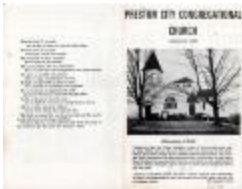
Preston City Congregational Church history pamphlet (undated) - at least 1966 (Coll. 003 Fold. 063 Doc. 019)