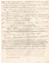
A Book of Record for the First Church in Preston Transcripts pg. 10 (Coll. 003 Fold. 061 Doc. 010)