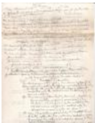
A Book of Record for the First Church in Preston Transcripts pg. 34 (Coll. 003 Fold. 061 Doc. 018)