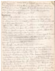
A Book of Record for the First Church in Preston Transcripts pg. 16-32 (Coll. 003 Fold. 061 Doc. 016)