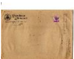
Rebuilding Long Society Church - 1817 & old papers (Coll. 003 Fold. 068 Doc. 001)