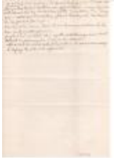
A Book of Record for the First Church in Preston Transcripts pg. 9 (Coll. 003 Fold. 061 Doc. 009)