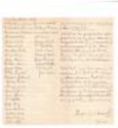
On the back of an old will of Jonah Witter's dated 1797 (Coll. 003 Fold. 060 Doc. 011)