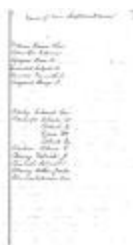
Names of men drafted into service. (2019.000.0078)