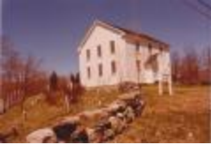
Long Society Church (Photographs Fold. 005 Photo 103)