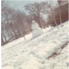
Mr. Snowman (MS B10 Photo Albums_1967_01)