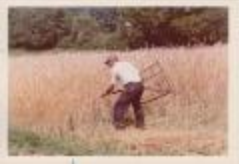
Lynwood Crary mowing scythe demonstration (circa 1974) (Photographs Fold. 009 Photo 175)