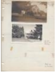
#75 Aldo Gasparino Home (Coll. 003 Vol. 002 Photo 007)