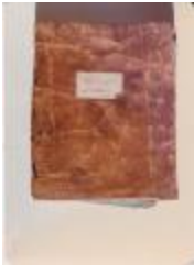
Preston Book of Marks (cover) (Photographs Fold. 009 Photo 159)