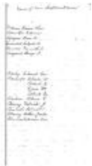
Names of men drafted into service. (2019.000.0078)