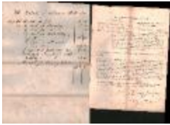
Letter of Administration (2019.000.0013)