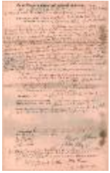
Property deed (2019.000.0007)