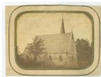
Photograph: St. Matthew's Church (2018.1.1)