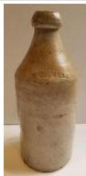
Grumman Beer Bottle (2008.24.1)