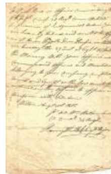
Regimental Orders for 34th Connecticut Militia (2013.15.1D)