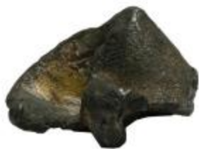
King George Statue Fragment (65.27.1)