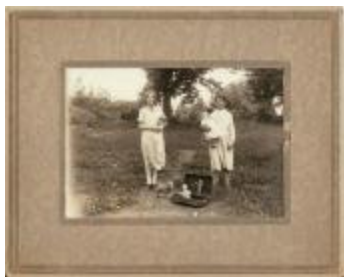
Photograph: Nod Hill School "Toy Maker" (97.7.2)