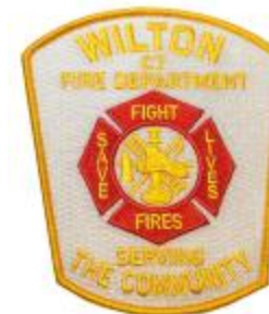
Wilton Fire Department Patch (2017.16.1)