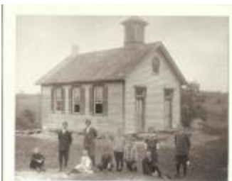
Photograph: Nod Hill Students (97.21.3)