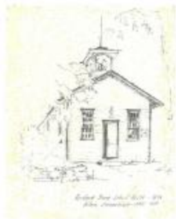
Hurlbutt Street Schoolhouse Exterior Illustration (2020.3.1)