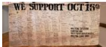
Vietnam War Protest Banner (97.4.1)