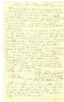
Regimental Orders for 34th Connecticut Militia (2013.15.1C)