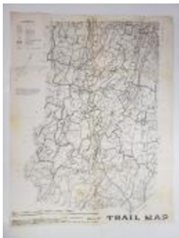
Wilton Trail Map (2020.1.4)