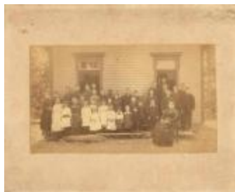
Photograph: Nod Hill School 1888 (97.21.6)