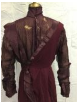
Dress with Jacket (2001.20.1A-C)