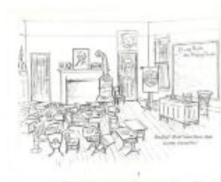
Hurlbutt Street Schoolhouse Interior Illustration (2020.3.2)