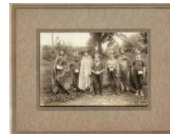
Photograph: Nod Hill School Students (97.7.1)