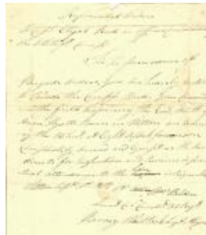
Regimental Orders for 34th Connecticut Militia (2013.15.1 E)