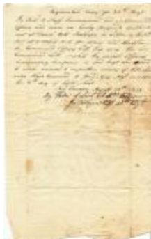
Regimental Orders for 34th Connecticut Militia (2013.15.1B)