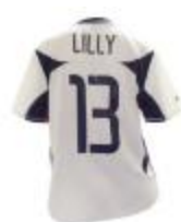
Kristine Lilly Jersey (2017.9.3)