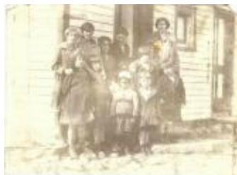
Photograph: Nod Hill School Students & Teacher (97.6.1)