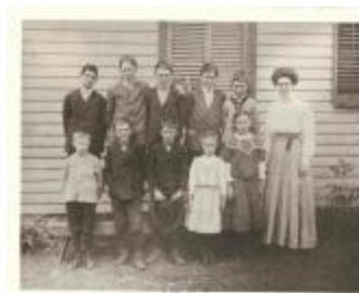
Photograph: Nod Hill Students and Teacher (97.21.2)