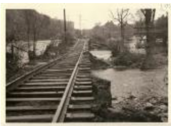
Photograph: Wilton Flood, 1955 (2017.32.2)