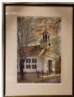
Congregational Church Lithograph (2010.10.1A,B)