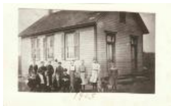
Photograph: Nod Hill School Students (97.21.1)