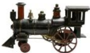
Ives Model Train (2007.3.1A,B)