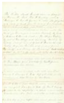
Abstract of Title (2001.22.5)