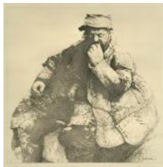
Print of the Old Leatherman (2017.5.1 A,B)