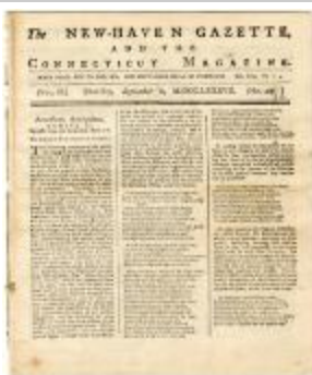
New Haven Gazette Newspaper (2022.12.1)