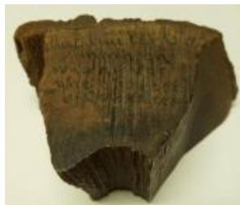
Fragment of Charter Oak (67.10.2)