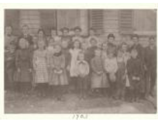
Photograph: Nod Hill School Students (97.21.5)