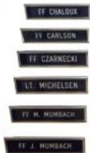
Wilton Fire Department Name Tags (2017.16.2A-F)