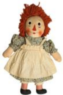
Raggedy Ann Doll (2013.31.1A-D)