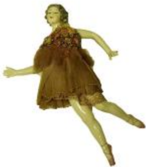
Ceramic Statuette (79.3.2)