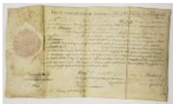
Commission: Salmon Hubbell (99.11.2)