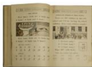
"City Arithmetics" Math Textbook (2002.16.12)