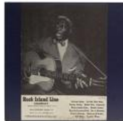
"Rock Island Line" Album and Cover (2017.12.2A-C)