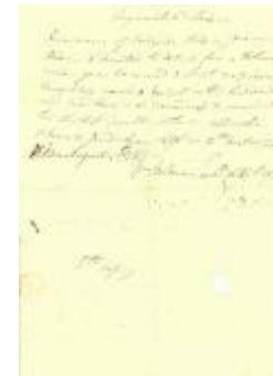
Regimental Orders for 34th Connecticut Militia (2013.15.1A)