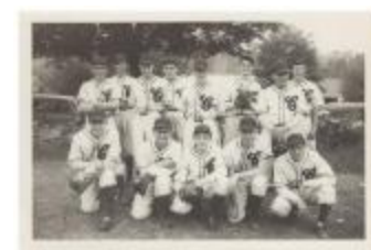
Cannondale Baseball Team Photo (2021.2.4A)