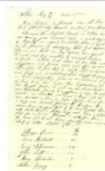
Wilton Baptist Church Document (2022.3.1)