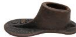
Shoe Last (2016.13.3 A)