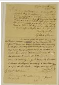
Silliman-Wooster Reinforcement Letter (2021.8.24)