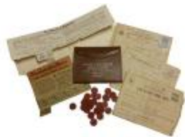
World War II Ration Vouchers (2013.10.1 A-I)