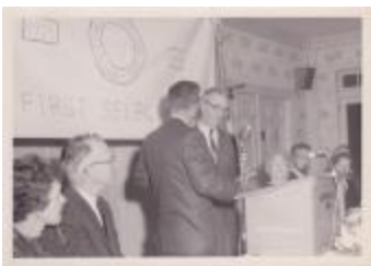
unidentified assembly (Photographs Fold. 007 Photo 135)