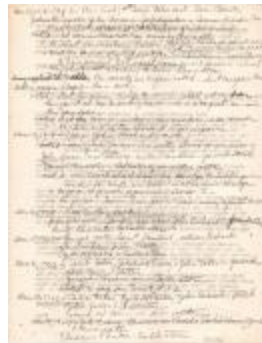
A Book of Record for the First Church in Preston Transcripts pg. 12 (Coll. 003 Fold. 061 Doc. 012)