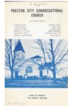
Preston City Congregational Church brochure for the Park/E/S Society 1972 Annual Meeting., dated 6 August 1972 by hand inscription. Two

Lecture on Old Houses (Coll. 001 Fold. 003 Doc. 033)