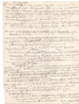
A Book of Record for the First Church in Preston Transcripts pg. 8 (Coll. 003 Fold. 061 Doc. 008)