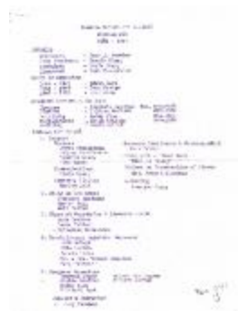
Preston Historical Society Program for 1966- 1967 (Coll. 003 Fold. 077 Doc. 041)