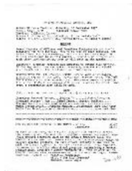
PHS Annual Meeting 1977 (Coll. 003 Fold. 077 Doc. 060)