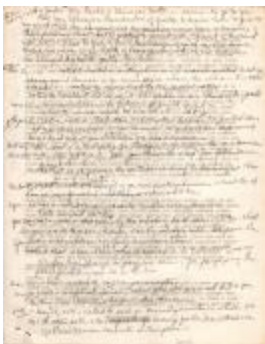
A Book of Record for the First Church in Preston Transcripts pg. 14 (Coll. 003 Fold. 061 Doc. 014)