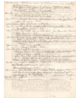
A Book of Record for the First Church in Preston Transcripts pg. 13 (Coll. 003 Fold. 061 Doc. 013)