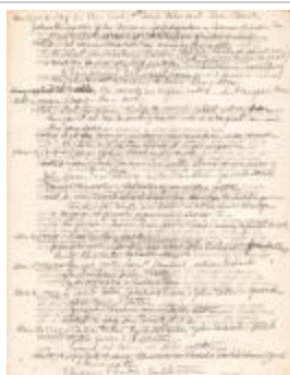
A Book of Record for the First Church in Preston Transcripts pg. 12 (Coll. 003 Fold. 061 Doc. 012)