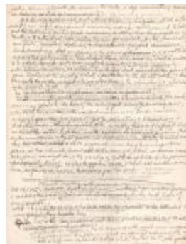
A Book of Record for the First Church in Preston Transcripts pg. 6 (Coll. 003 Fold. 061 Doc. 006)