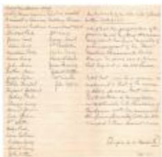
On the back of an old will of Jonah Witter's dated 1797 (Coll. 003 Fold. 060 Doc. 011)