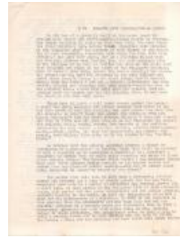
#69 Preston City Congregational Church (Coll. 003 Fold. 063 Doc. 020)