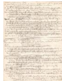
A Book of Record for the First Church in Preston Transcripts pg. 7 (Coll. 003 Fold. 061 Doc. 007)