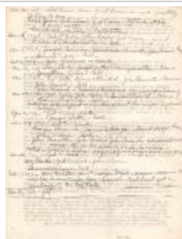
A Book of Record for the First Church in Preston Transcripts pg. 13 (Coll. 003 Fold. 061 Doc. 013)