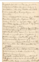
M. Hall's Notes on Congregational Church History pg. 3 (Coll. 003 Fold. 063 Doc. 003)