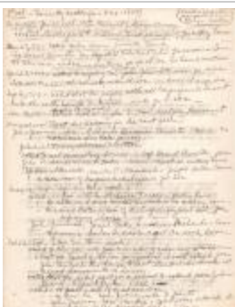
A Book of Record for the First Church in Preston Transcripts pg. 11 (Coll. 003 Fold. 061 Doc. 011)