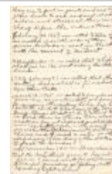
M. Hall's Notes on Congregational Church History pg. 10 (Coll. 003 Fold. 063 Doc. 010)