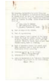
Preston City Congregational Church Response to Committee on Connecticut Congregational History - November 1965 (Coll. 003 Fold. 063)