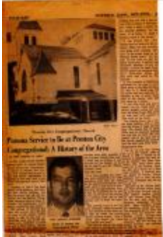
Pomona Service to Be at Preston City Congregational; A History of the Area (Coll. 003 Fold. 063 Doc. 022)