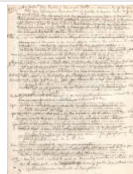
A Book of Record for the First Church in Preston Transcripts pg. 14 (Coll. 003 Fold. 061 Doc. 014)