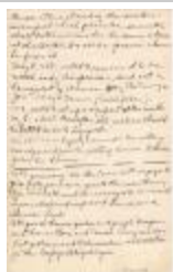
M. Hall's Notes on Congregational Church History pg. 2 (Coll. 003 Fold. 063 Doc. 002)