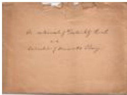
Bi-centennial of Preston City Church and Dedication of Monument & Library (Coll. 003 Fold. 060 Doc. 001)