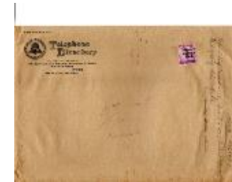
Rebuilding Long Society Church - 1817 & old papers (Coll. 003 Fold. 068 Doc. 001)