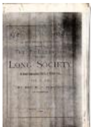
Copy of A Historic Discourse delivered at The Re-Dedication of the Long Society or Second Congregational Church, Preston, Conn. (Coll. 003 Fold. 068 Doc. 002)