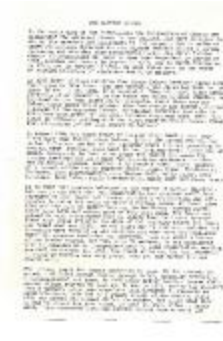
Baptist Church information (Coll. 003 Fold 054 Doc. 005)