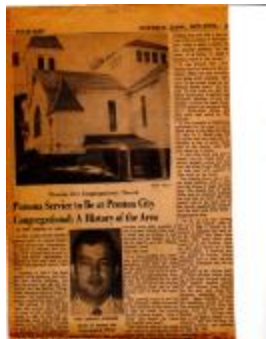
Pomona Service to Be at Preston City Congregational; A History of the Area (Coll. 003 Fold. 063 Doc. 022)