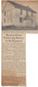
Meeting House with Long History to be Repaired (Coll. 001 Fold. 003 Doc. 018)