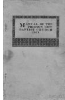
Manual of the Preston City Baptist Church 1911 (Coll. 003 Fold 054 Doc. 003)