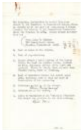
Preston City Congregational Church Response to Committee on Connecticut Congregational History - November 1965 (Coll. 003 Fold. 063)