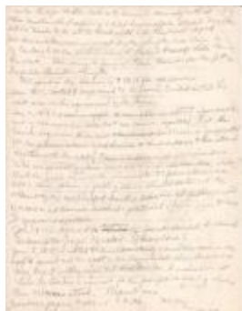
M. Hall Notes on Long Society - single page (Coll. 003 Fold. 068 Doc. 003)