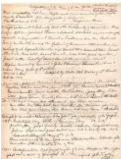
Certifications of Ch. Mem. of E. Soc. Folks (Coll. 003 Fold. 060 Doc. 014)