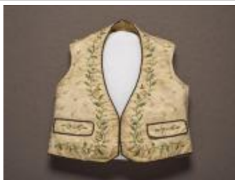
Textile: Miniature embroidered silk vest belonging to Charles S. Stratton (1976.001.099)