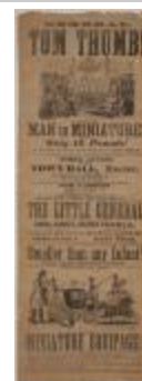
Advertisement: Broadside "General Tom Thumb, Man in Miniature, arriving in Exeter" (T 2013.010.001)