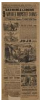
Advertisement: Handbill for "Barnum & London 9-Married Monster Shows" (2003.009.106)