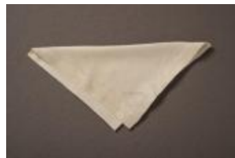
Clothing accessory: Handkerchief with P. T. Barnum signature (T 2014.001.001)