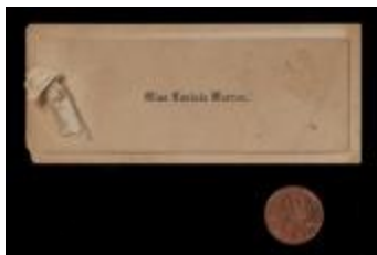
Calling card: Dual calling card for Miss Lavinia Warren and Charles S. Stratton (1981.002.001)