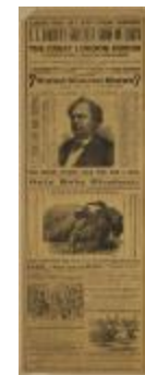
Advertisement: Handbill for "P.T. Barnum's Greatest Show on Earth, The Great London Circus, and Sanger's Royal British Menagerie 7