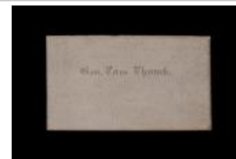
Calling Card: Calling card for "Gen. Tom Thumb" (T 2016.028.001)