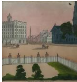
Physical object: Clock component, Painted glass panel from mantel clock, "View in Broadway, New York" (2015.009.001)