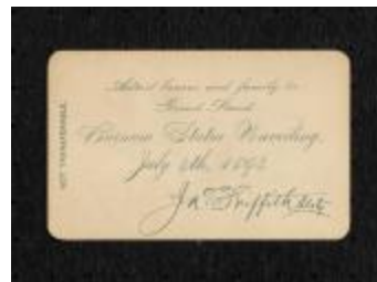
Ticket: Ticket to unveiling of the P. T. Barnum statue, 1893 (2003.009.011)