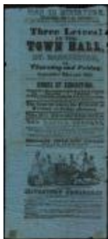
Advertisement: Handbill for "Man in Miniature (General Tom Thumb), arriving in Great Barrington" (2003.009.060)