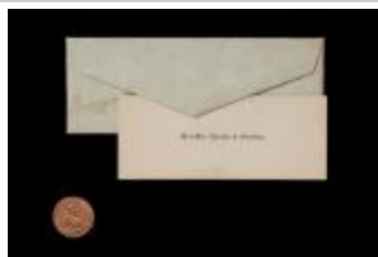
Physical object: Calling card for Mr. and Mrs. Charles S. Stratton (T 2016.026.001 AB)