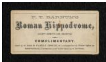
Ticket: Complimentary ticket to "P. T. Barnum's Roman Hippodrome" (EL 1988.022.005)