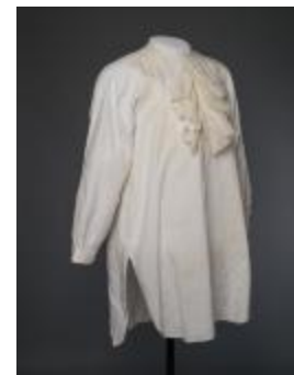
Textile: Dress shirt with ruffle worn by P. T. Barnum (2003.009.016)