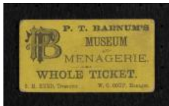
Ticket: "P. T. Barnum's Museum and Menagerie Whole Ticket" (EL 1988.022.002)