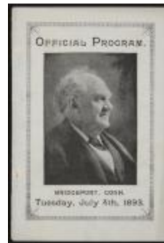
Program: "Unveiling of the Barnum Statue" (EL 1989.040.011)