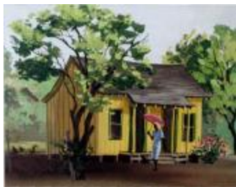
House at Brackettville, Texas (200)