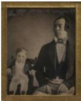
Photograph: Daguerreotype of Charles S. Stratton (General Tom Thumb) and his father, seated, 1843 (EL 1988.067.001)