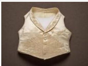
Textile: Wedding vest belonging to Charles S. Stratton (1976.001.096)