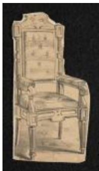
Toys and games: M. Lavinina Warren paper doll, arm chair (2003.009.062 I)