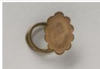
Jewelry: Cufflink belonging to Charles S. Stratton (1976.001.109)