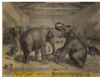
Print: "Interior View of Elephant Building," 1882 (T 2013.042.001)