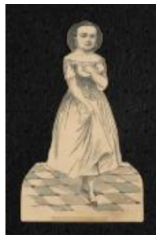
Toys and games: M. Lavinina Warren paper doll, figure in undergarments (2003.009.062 A)