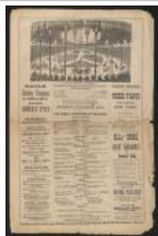
Advertisement: Ad for P.T. Barnum's Hippodrome at Back Bay in Boston (BF 1994.007.002)