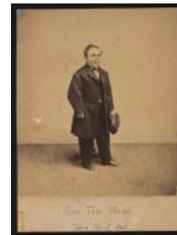
Photograph: Charles S. Stratton, full length portrait against plain background (EL 1989.184.001)