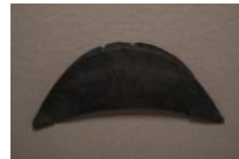
Textile: Bicorn hat belonging to Charles S. Stratton (EL 1988.126.001)