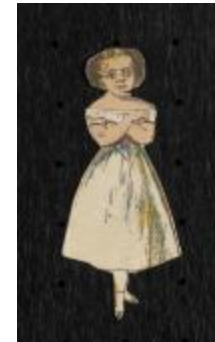
Toys and games: Minnie Warren paper doll, figure in undergarments (2003.009.062 H)