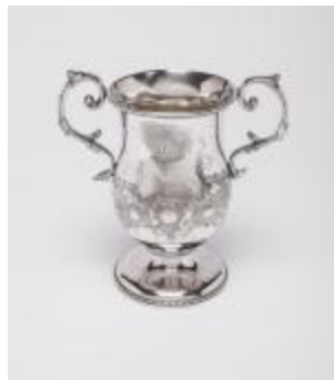
Food service: Silver spoon holder with initials of P. T. Barnum (EL 1989.016.001)