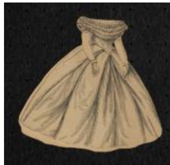
Toys and games: M. Lavinia Warren paper doll dresses in white and pink (EL 1988.107.001)