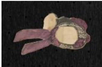
Toys and games: M. Lavinina Warren paper doll, burgundy bonnet (2003.009.062 D)