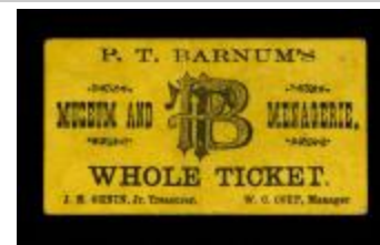
Ticket: "Whole Ticket to P. T. Barnum's Museum and Menagerie" (EL 1988.022.001)