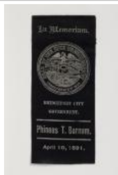
Textile: Memorial ribbon for P. T. Barnum's funeral (MS 002.117.001)