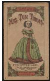
Toys and games: M. Lavinia Warren paper doll set (partial) with two dresses (EL 1988.106.001)