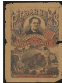
Courier: P. T. Barnum's Centennial Advanced Daily (T 2016.006.001)