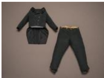
Textile: Black wool suit belonging to Charles S. Stratton (General Tom Thumb) (1888.002.001 AB)