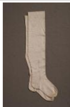
Textile: Pair of stockings belonging to M. Lavinia Warren (EL 1988.158.001 AB)