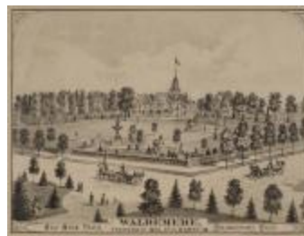
Print: "Waldemere, Home of Hon. P. T. Barnum" (T 2016.040.001)