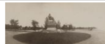
Photograph: Statue of P.T. Barnum in Seaside Park, Bridgeport, 1894 (T 2013.015.001)