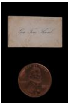
Calling Card: Calling card for "Gen. Tom Thumb" (T 2016.029.001)