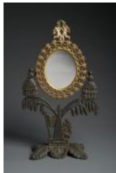
Decorative object: Dressing table mirror with Jenny Lind figures (T 2015.054.001)