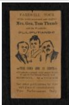
Ticket: Ticket for the Farewell Tour of Mrs. Gen. Tom Thumb and the Wonderful Liliputians (T 2016.025.001)