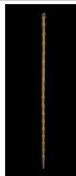
Equipment: Miniature walking stick belonging to Charles S. Stratton (General Tom Thumb) (BF 1997.019.005)