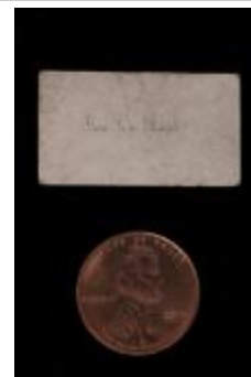
Calling Card: Calling card for "Gen. Tom Thumb" (1977.003.001)