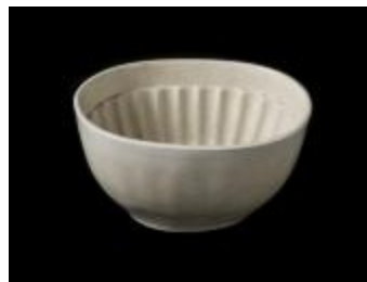
Food service: Ironstone pudding mold with elephant (EL 1989.006.001)