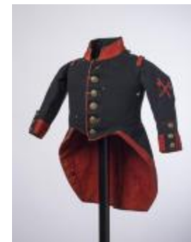
Textile: Military style jacket belonging to Charles S. Stratton (2014.006.001)