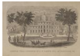
Print: "Oriental Villa - Residence of P.T. Barnum, Esq., at Bridgeport, CT" (T 2014.020.001)