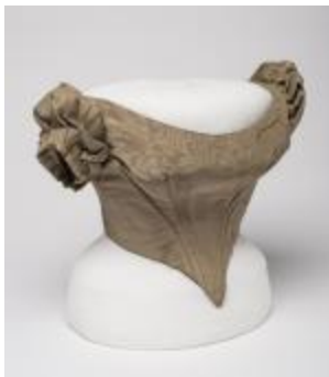
Textile: Bodice belonging to M. Lavinia Warren (T 2015.001.001)