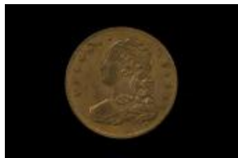
Physical object: Brass token with Lady Liberty and General Tom Thumb (2000.007.003)