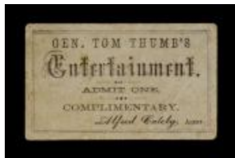
Ticket: "Gen. Tom Thumb's Entertainment" (EL 1988.266.001)