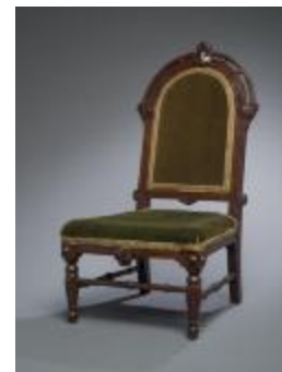
Furniture: Chair belonging to Charles S. Stratton (EL 1988.052.001)