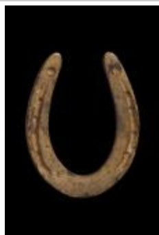
Transportation T & E: Horseshoe belonging to one of Charles S. Stratton's ponies (EL 1988.141.001 )