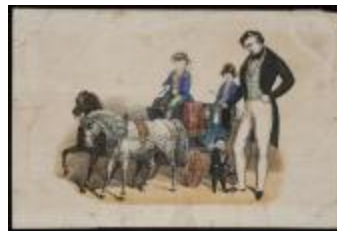
Print: Charles S. Stratton (General Tom Thumb ) next to his miniature carriage (T 2015.059.001)