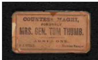
Ticket: "Countess Magri formerly Mrs. Gen. Tom Thumb" (EL 1988.276.001 AB)