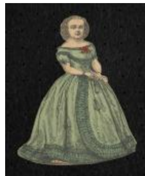
Toys and games: M. Lavinina Warren paper doll, figure wearing green dress (2003.009.062 B)