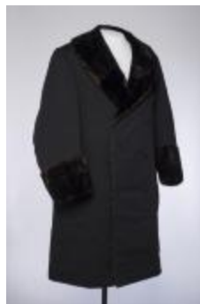
Textile: Winter coat belonging to P. T. Barnum (1969.001.001)