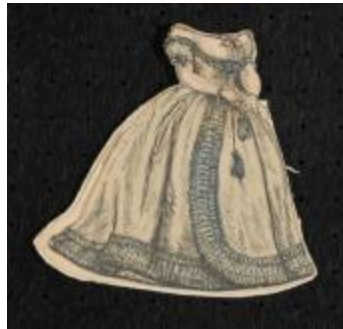
Toys and games: M. Lavinina Warren paper doll, white and blue dress (2003.009.062 F)