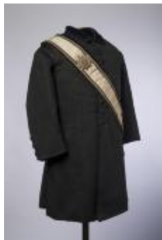
Textile: Masonic uniform jacket and accessories belonging to Charles S. Stratton (2014.007.001 AD)