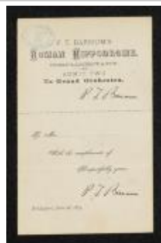
Ticket: "Complimentary ticket to P.T. Barnum's Roman Hippodrome, June 27, 1874" (2003.009.036)