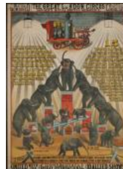
Poster: "Fifteen Trained Elephants in Towering Pedestal Pyramid" (2006.007.002)