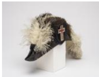
Textile: Masonic uniform hat belonging to Charles S. Stratton (2014.007.001 E)