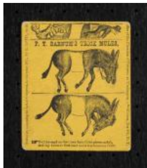
Advertisement: Puzzle featuring "P. T. Barnum's Trick Mules" (2003.009.073)