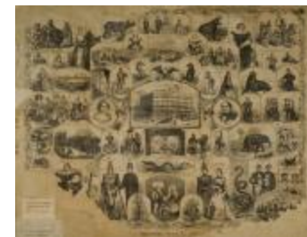
Poster: "Barnum's American Museum, Performance Three Times Daily, [Sun]rise till 10" (T 2014.025.001)