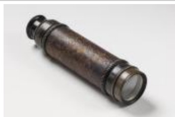
Transportation T & E: Nautical spyglass owned by Charles S. Stratton (EL 1988.129.001)