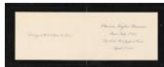
Program: "In Memorium" card for P.T. Barnum (EL 1988.034.002)