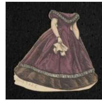
Toys and games: M. Lavinina Warren paper doll, burgundy dress (2003.009.062 C)