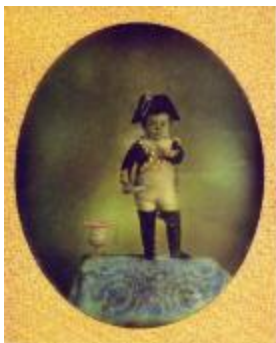
Photograph: General Tom Thumb (Charles S. Stratton) as Napoleon (1943.003.001)