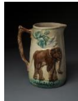
Food Service: Pitcher featuring Jumbo the elephant (EL 1989.007.001)