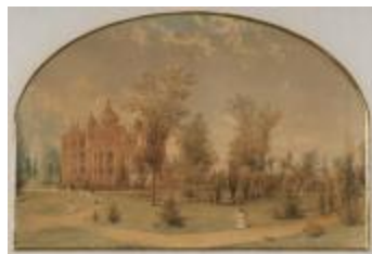
Painting: View of Iranistan seen from east vantage point (2006.005.003)