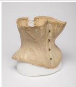
Textile: Corset belonging to M. Lavinia Warren (BF 1993.018.003 AB)