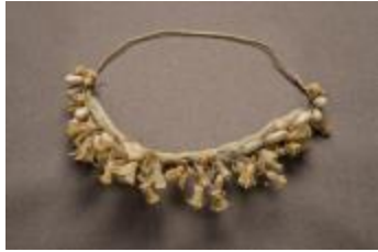
Textile: Bridal headpiece belonging to M. Lavinia Warren (T 2017.004.001)