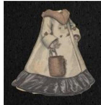
Toys and games: M. Lavinina Warren paper doll, winter coat with fur collar and muff (2003.009.062 G)