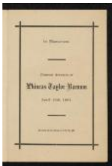
Program: Memorial Program from P.T. Barnum's Funeral (T 2016.030.001)