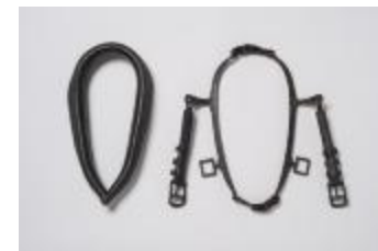
Transportation T & E: Pony collar and hames (T 2016.061.002 AB)