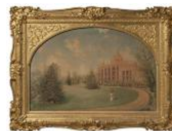
Painting: View of Iranistan from southeast vantage point (1996.009.001)