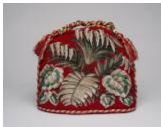
Food service: Tea cozy belonging to P. T. Barnum (2003.009.079)