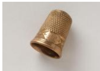
Textile equipment: Thimble belonging to M. Lavinia Warren (1981.004.009)