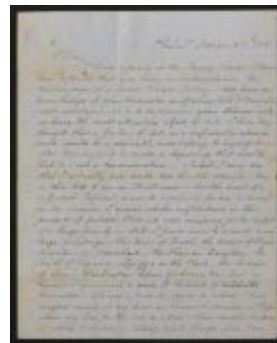
Letter: To P.T. Barnum from Rembrandt Peale, October 25, 1851 (2003.009.077)