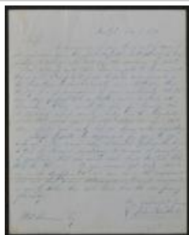
Letter: To P.T. Barnum from C. VanDerbilt, December 6, 1850 (2003.009.042)