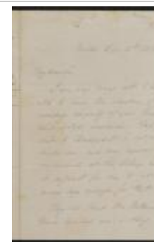
Letter: To P.T. Barnum from O.W. Holmes, December 15, 1853 (2003.009.040)