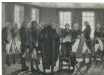
Dramatic Farewell at Fraunces Tavern, from the portfolio, The Bicentennial Pageant of George Washington (1437)