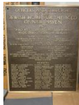
Dedication plaque for the 1976 addition to the Jewish Home (2022.1.25)