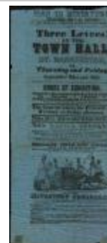
Advertisement: Handbill for "Man in Miniature (General Tom Thumb)", arriving in Great Barrington" (2003.009.060)