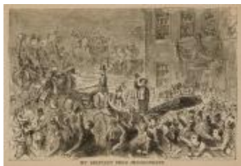
Book: Select illustrations from the book, "Life of Barnum" (2003.009.117)