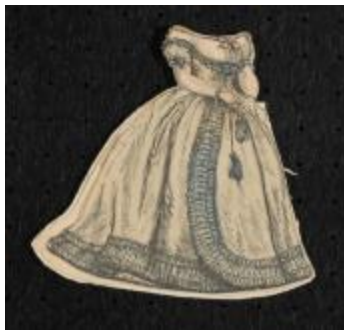
Toys and games: M. Lavinina Warren paper doll, white and blue dress (2003.009.062 F)