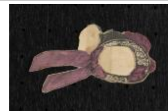
Toys and games: M. Lavinina Warren paper doll, burgundy bonnet (2003.009.062 D)