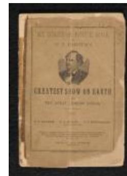
Book: Circus Route Book for 1883 (2003.009.025)