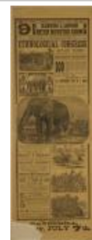
Advertisement: Handbill for "Barnum and London 9 United Monster Shows in Haverhill, July 7" (2003.009.104)