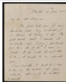
Letter: To P.T. Barnum from Edward Everett, June 27, 1853 (2003.009.039)