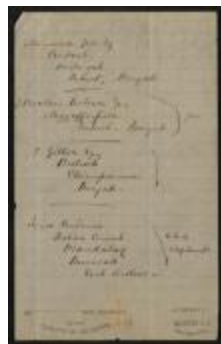
Document: Note written by P.T. Barnum regarding elephants, February 20, 1882 (2003.009.017)