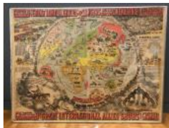
Poster: Great London Circus & Sangers Royal British Menagerie, 1879 (2020.003.001)