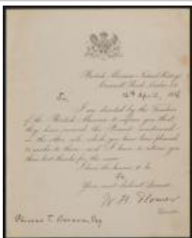
Letter: To P.T. Barnum from W.H. Flower, director of British Museum, April 12, 1886 (2003.009.041)