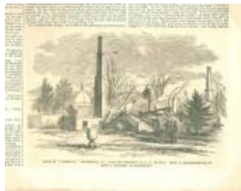
Newspaper: Clipping featuring illustration of "Ruins of Iranistan" (2003.009.076)