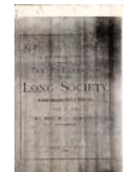
Copy of A Historic Discourse delivered at The Re-Dedication of the Long Society or Second Congregational Church, Preston, Conn. (Coll. 003 Fold. 068 Doc. 002)