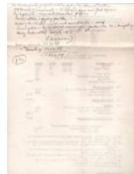
A Book of Record for the First Church in Preston Transcripts pg. 33 (Coll. 003 Fold. 061 Doc. 017)