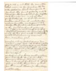
M. Hall's Notes on Congregational Church History pg. 8 (Coll. 003 Fold. 063 Doc. 008)