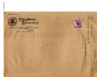
Rebuilding Long Society Church - 1817 & old papers (Coll. 003 Fold. 068 Doc. 001)