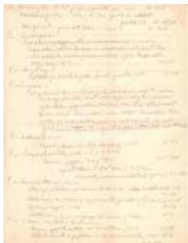
M. Hall's Notes from col. VI of Preston City Congregational Church Records (Coll. 003 Fold. 063 Doc. 025)