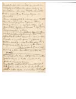
M. Hall's Notes on Congregational Church History pg. 3 (Coll. 003 Fold. 063 Doc. 003)