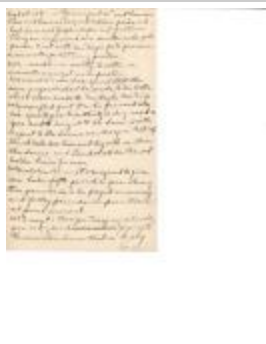
M. Hall's Notes on Congregational Church History pg. 1 (Coll. 003 Fold. 063 Doc. 001)