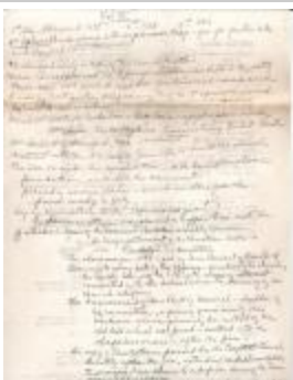
A Book of Record for the First Church in Preston Transcripts pg. 34 (Coll. 003 Fold. 061 Doc. 018)