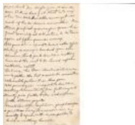
M. Hall's Notes on Congregational Church History pg. 6 (Coll. 003 Fold. 063 Doc. 006)