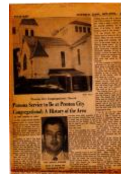
Pomona Service to Be at Preston City Congregational; A History of the Area (Coll. 003 Fold. 063 Doc. 022)