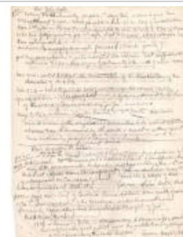
A Book of Record for the First Church in Preston Transcripts pg. 8 (Coll. 003 Fold. 061 Doc. 008)