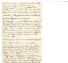
M. Hall's Notes on Congregational Church History pg. 7 (Coll. 003 Fold. 063 Doc. 007)