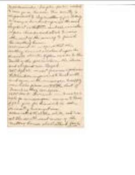
M. Hall's Notes on Congregational Church History pg. 4 (Coll. 003 Fold. 063 Doc. 004)