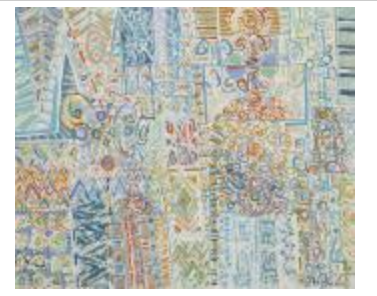
Venice V (0060)