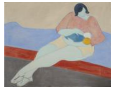
Mother Nursing (0069)