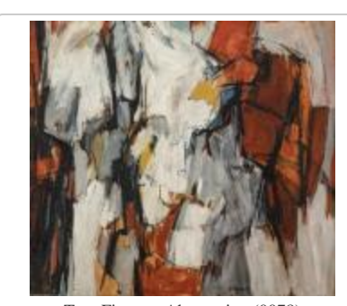
Two Figures: Abstraction (0078)