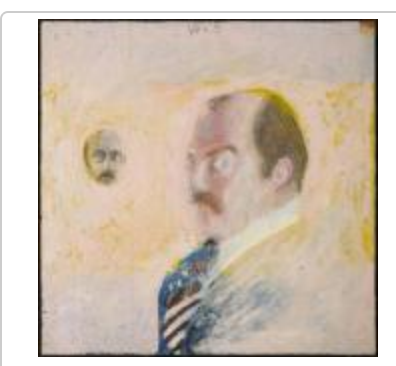
Self Portrait (0051)