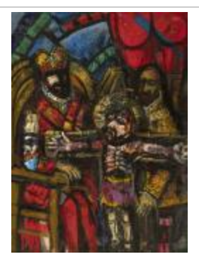
Medieval Apparition (0075)