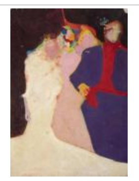
The Wedding (0076)