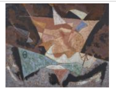
The Ship of Odysseus (0043)