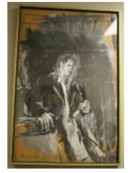
Self Portrait (0072)