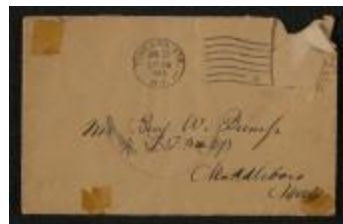
Letter: My dear brother and sister Edith from Sister Vinnie (M. Lavinia Warren), June 20, 1915 (MS 0003.106.002)