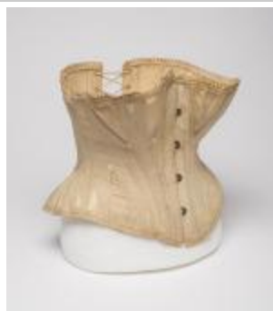
Textile: Corset belonging to M. Lavinia Warren (BF 1993.018.003 AB)