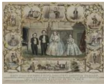
Print: "The Fairy Wedding" of General Tom Thumb (Charles S. Stratton) by Currier and Ives (T 2016.048.001)