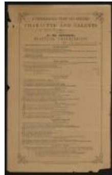
Document: Phrenology chart for M. Lavinia Warren, 1871 (MS 0003.117.001)