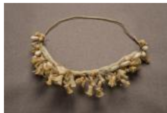
Textile: Bridal headpiece belonging to M. Lavinia Warren (T 2017.004.001)