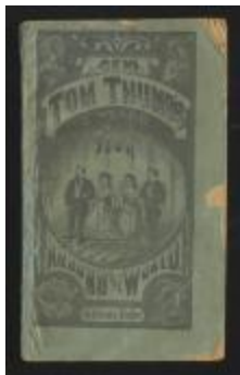
Book: "Tom Thumb's Three Years Tour Around the World" (front and back covers only) (EL 1988.086.001)