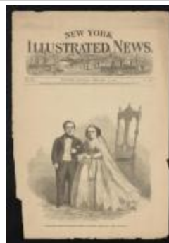
Newspaper: Cover illustration of New York Illustrated, featuring the Fairy Wedding, February 21, 1863 (1982.019.001)