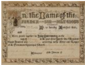
Document: "Marriage Certificate of Charles Stratton (General Tom Thumb) to Mercy Lavinia Warren Bump (Lavinia Warren)" (T 2013.036.001)