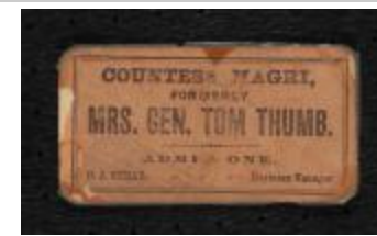
Ticket: "Countess Magri formerly Mrs. Gen. Tom Thumb" (EL 1988.276.001 AB)