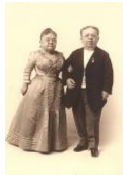
Lavinia Warren Stratton Magri and Count Primo Magri (POR_T3_Stratton_LaviniaW_01)