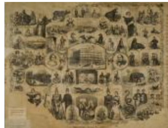
Poster: "Barnum's American Museum, Performance Three Times Daily, [Sun]rise till 10" (T 2014.025.001)