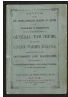
Book: "Sketch of the Life of General Tom Thumb and Lavinia Warren Stratton", 1867 (covers only) (T 2014.033.001)