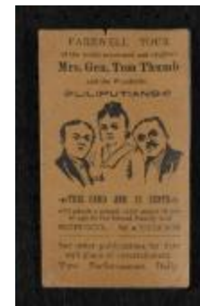
Ticket: Ticket for the Farewell Tour of Mrs. Gen. Tom Thumb and the Wonderful Liliputians (T 2016.025.001)