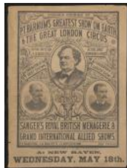
Courier: Advance Courier of Barnum's Greatest Show on Earth and the Great London Circus for May 18, 1881 (T 2015.055.001)