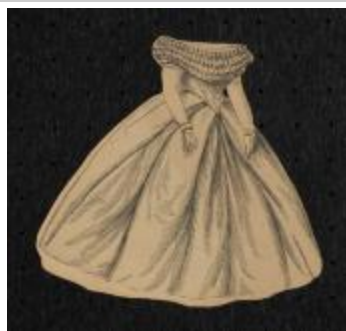
Toys and games: M. Lavinia Warren paper doll dresses in white and pink (EL 1988.107.001)