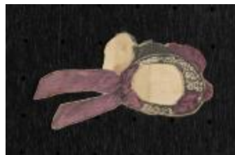
Toys and games: M. Lavinina Warren paper doll, burgundy bonnet (2003.009.062 D)