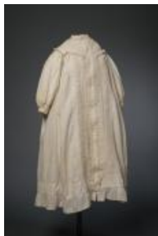
Textile: Nightgown belonging to M. Lavinia Warren (1976.001.008)