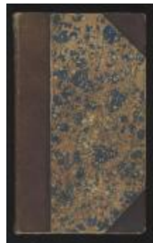
Book: "Tom Thumb's Three Years Tour Around the World" (inscribed copy) (EL 1988.087.001)