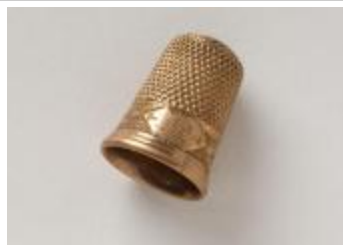
Textile equipment: Thimble belonging to M. Lavinia Warren (1981.004.009)