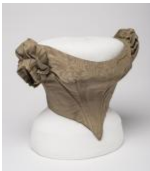
Textile: Bodice belonging to M. Lavinia Warren (T 2015.001.001)