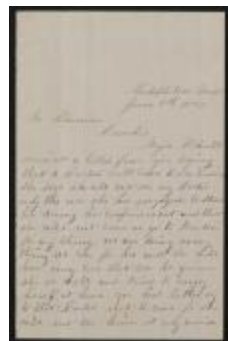
Letter: To P.T. Barnum from M. Lavinia Warren, June 5, 1878 (2003.009.035)