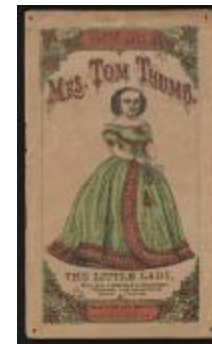
Toys and games: M. Lavinia Warren paper doll set (partial) with two dresses (EL 1988.106.001)