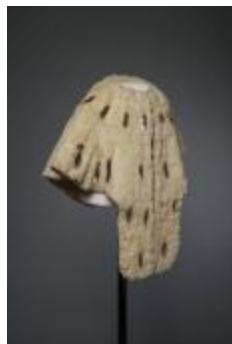
Textile: Fur cape belonging to M. Lavinia Warren (1976.001.035)