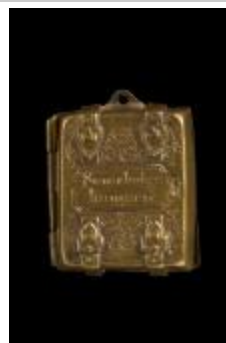
Jewelry: Fairy Wedding souvenir locket (BF 1995.019.001)