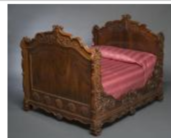
Furniture: Miniature bed made for Charles S. Stratton and M. Lavinia Warren (EL 1988.056.001)