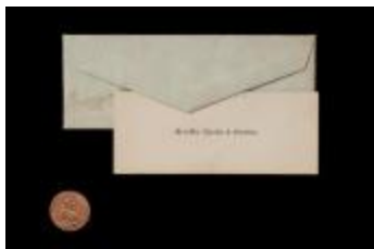
Physical object: Calling card for Mr. and Mrs. Charles S. Stratton (T 2016.026.001 AB)