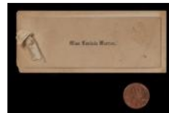
Calling card: Dual calling card for Miss Lavinia Warren and Charles S. Stratton (1981.002.001)