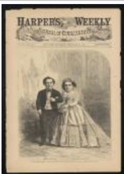
Newspaper: Cover and article from Harper's Weekly for February 21, 1863, featuring the Fairy Wedding (BF 1990.009.001-005)