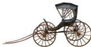
Transportation T & E: Pony phaeton carriage owned by Charles S. Stratton and M. Lavinia Warren (1976.001.094)