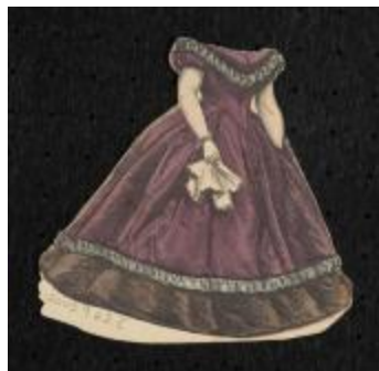
Toys and games: M. Lavinina Warren paper doll, burgundy dress (2003.009.062 C)