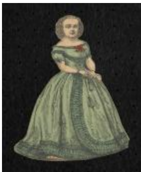
Toys and games: M. Lavinina Warren paper doll, figure wearing green dress (2003.009.062 B)