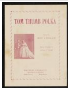
Sheet Music: "Tom Thumb Polka" with a "History of Mr. and Mrs. Tom Thumb" (EL 1988.153.001)