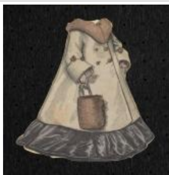
Toys and games: M. Lavinina Warren paper doll, winter coat with fur collar and muff (2003.009.062 G)