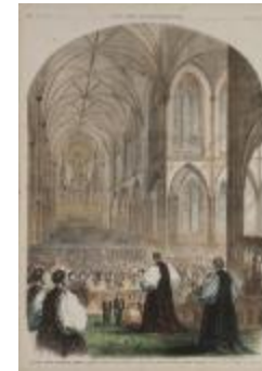
Newspaper: "The Fairy Wedding - The Marriage Ceremony of Charles S. Stratton (Gen. Tom Thumb) and Miss Lavinia Warren (the Queen of