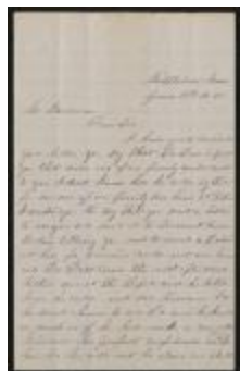
Letter: To P.T. Barnum from M. Lavinia Warren, June 12, 1878 (2003.009.013)