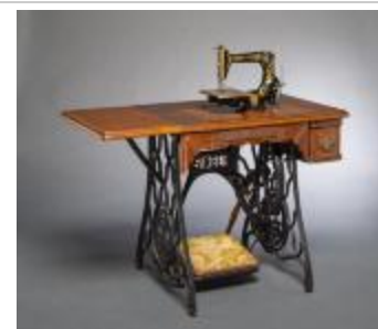
Textile equipment: Sewing machine owned by M. Lavinia Warren (2018.009.001)