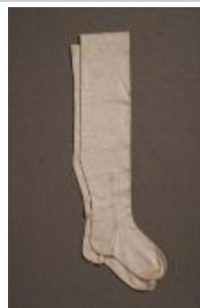
Textile: Pair of stockings belonging to M. Lavinia Warren (EL 1988.158.001 AB)