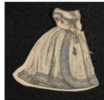
Toys and games: M. Lavinina Warren paper doll, white and blue dress (2003.009.062 F)