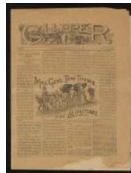
Newspaper: The Clipper with article about M. Lavinia Warren and Primo Magri (T 2016.020.001)