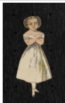
Toys and games: Minnie Warren paper doll, figure in undergarments (2003.009.062 H)