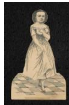
Toys and games: M. Lavinia Warren paper doll, figure in undergarments (2003.009.062 A)