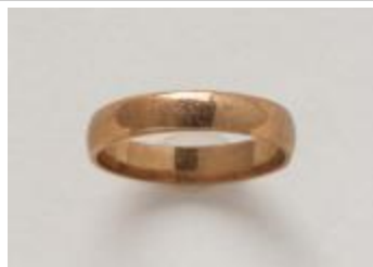
Jewelry: Lavinia Warren's Wedding Ring (1981.004.008)