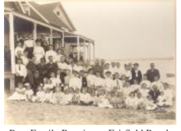
Burr Family Reunion at Fairfield Beach (POR_B40-Burr Family_001.tif)