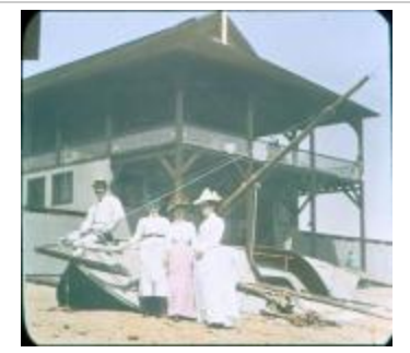
Fairfield Beach Club (MOW_080_Fairfield Beach Club-Sailboat)