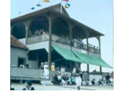
Fairfield Beach (MOW_107_Fairfield Beach-July-4)