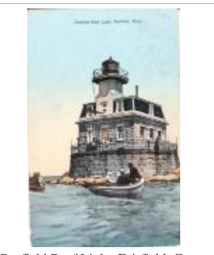
Penfield Reef Light, Fairfield, Conn. (PC_FF_Lighthouses_Penfield_01)