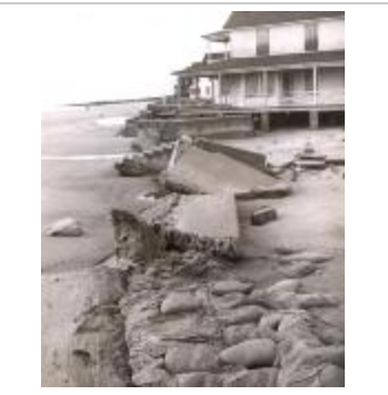
Hurricane of 1954-Fairfield Beach Damage (FF_Hurricane1954_004.tif)