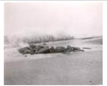
Hurricane of 1954 - Beach Dikes (FF_Hurricane1954_002)