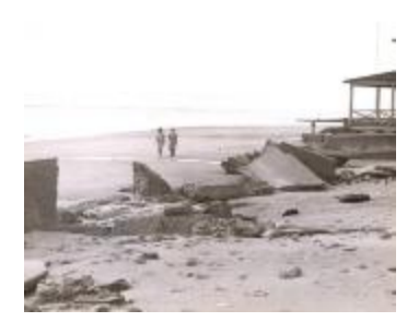
Hurricane of 1954-Fairfield Beach Aftermath (FF_Hurricane1954_003.tif)