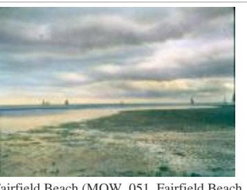
Fairfield Beach (MOW_051_Fairfield Beach Low Tide)