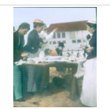
Beach Clambake (MOW_082_Beach Clambake)