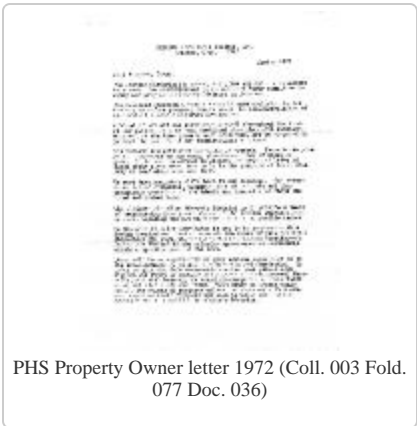
PHS Property Owner letter 1972 (Coll. 003 Fold. 077 Doc. 036)