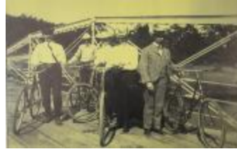
Photograph - Men and Women with Bicycles (E2013.Summer Leisure Exhibit.062)