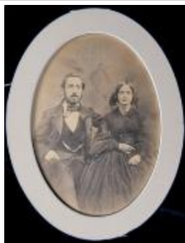
Photograph - Conklin Wedding Picture (74.3.6)