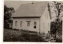
Photograph of Nathaniel S. Brown House, undated (Coll. 003 Fold. 067 Photo 002)

Crumbled wall repaired on historical stone bridge (Coll. 001 Fold. 001 Doc. 001)