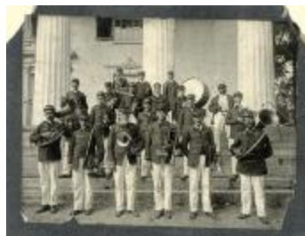
Photograph, Group Photo - Madison Band (2008.133 a b)