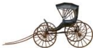
Transportation T & E: Pony phaeton carriage owned by Charles S. Stratton and M. Lavinia Warren (1976.001.094)