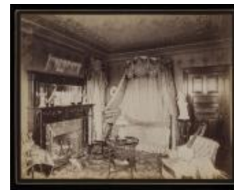
Photograph: "Mrs. Barnum's bedroom at Marina" (1970.006.003 ST)