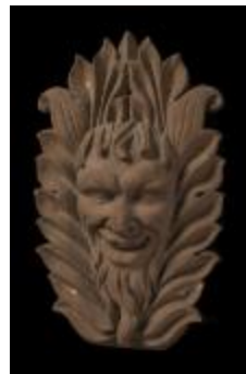
Architectural element: Decorative feature from Barnum's home, Iranistan (EL 1990.001.005)