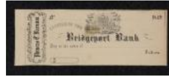
Check: Blank check for P. T. Barnum's account in the Bridgeport Bank, 1849 (2003.009.071)