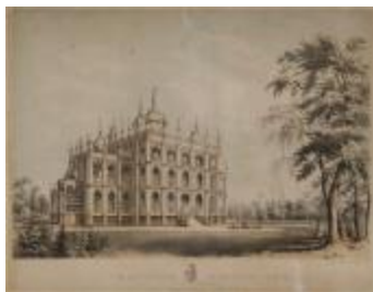
Print: "Iranistan, an Oriental Villa" (owned by the Barnum Museum) (T 2014.047.001)