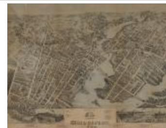
Map: "[Birdseye] View of Bridgeport, Connecticut, 1875" (1971.003.001)