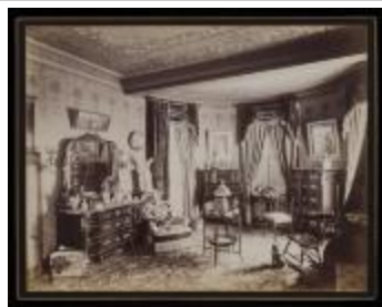
Photograph: "Mrs. Barnum's bedroom at Marina," second view (1970.006.003 UV)