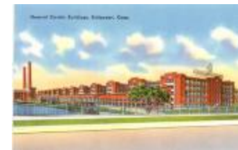
General Electric Buildings, Bridgeport, Conn. (PC_BPT_General Electric)