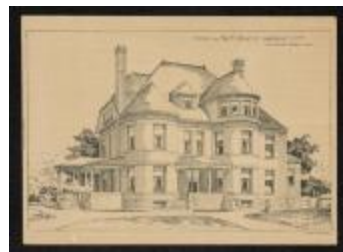
Print: "House for Mr. P.T. Barnum, Bridgeport, Conn." (T 2016.022.001)