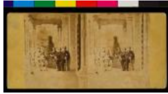
Photograph: Stereoview cards (2) of Barnum's home "Lindencroft" (T 2016.060.002)