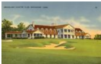
Brooklawn Country Club, Bridgeport, Conn. (PC_FF_Country Clubs-Brooklawn_002)