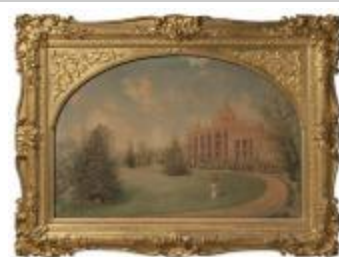
Painting: View of Iranistan from southeast vantage point (1996.009.001)