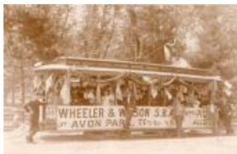
Bridgeport Trolley (BP_Transittrolleys_002)