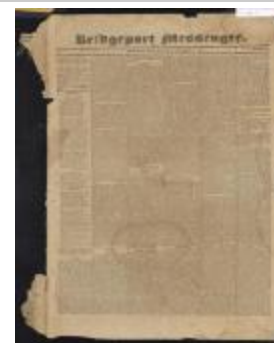
Newspaper: Bridgeport Messenger, Vol. I, No. 52, November 21, 1832 (1998.010.002)