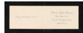
Program: "In Memorium" card for P.T. Barnum (EL 1988.034.002)