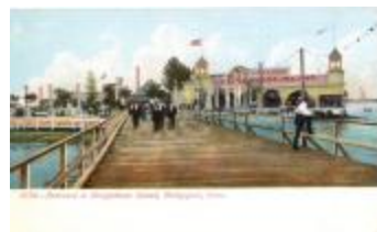
Entrance to Steeplechase Island, Bridgeport, Conn. (PC_BPT_Steeplechase_01)