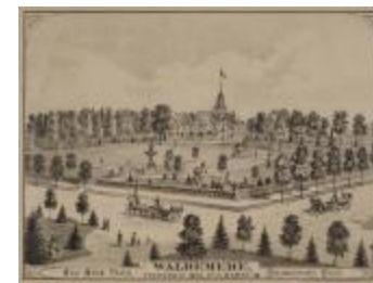
Print: "Waldemere, Home of Hon. P. T. Barnum" (T 2016.040.001)