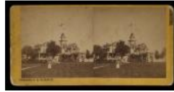
Photographs: Set of four stereoviews of Waldemere (T 2016.060.003)