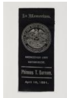
Textile: Memorial ribbon for P. T. Barnum's funeral (MS 002.117.001)