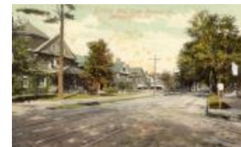
Fairfield Ave., from Norman St., Bridgeport, Conn. (PC_BPT_Street Scenes_Fairfield Ave_01)