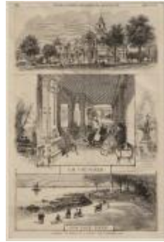
Newspaper: "Waldemere, On the Porch, Seaside Park" from Frank Leslie's Illustrated Newspaper, August 29, 1874 (2003.009.057)