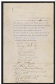
Document: Winter Quarters Petition, November 23, 1887 (MS 0004.114.001)