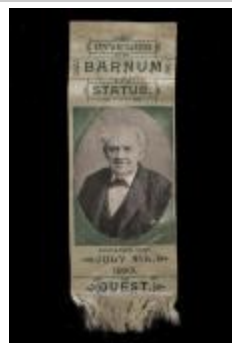
Souvenir: Ribbon badge for the "Unveiling of the Barnum Statue" (1989.040.011)