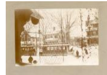
Park Avenue Trolley (BP_Transittrolleys_001)