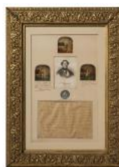
Framed items: P. T. Barnum's Tom Thumb Memorial Archive (T 2016.037.001)