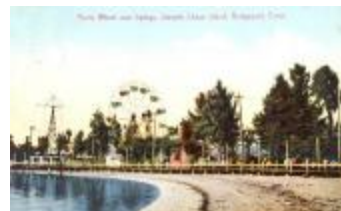
Ferris Wheel and Swings, Steeplechase Island, Bridgeport, Conn. (PC_BPT_Steeplechase_02)