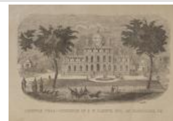
Print: "Oriental Villa - Residence of P.T. Barnum, Esq., at Bridgeport, CT" (T 2014.020.001)