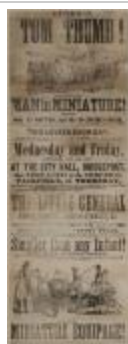
Advertisement: Broadside "General Tom Thumb, Man in Miniature, arriving in Bridgeport and Fairfield" (T 2013.009.001)