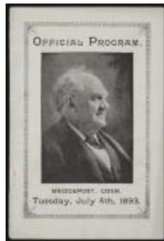
Program: "Unveiling of the Barnum Statue" (EL 1989.040.011)