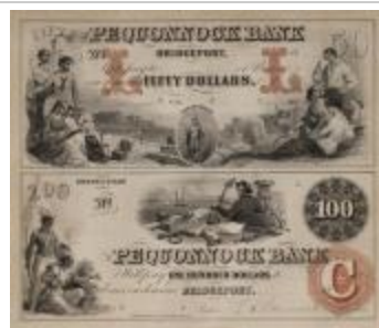
Document: Pequonnock Bank banknotes with signature of P.T. Barnum (T 2013.013.001)