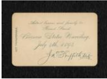
Ticket: Ticket to unveiling of the P. T. Barnum statue, 1893 (2003.009.011)