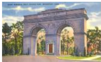
Perry Memorial Arch, Seaside Park. Bridgeport, Conn. (PC_BPT_Seaside Park_001)