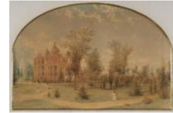
Painting: View of Iranistan seen from east vantage point (2006.005.003)