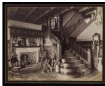
Photograph: "Hall at Marina" (1970.006.003 KL)