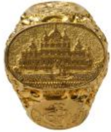
Jewelry: P. T. Barnum's gold ring (2007.002.051)