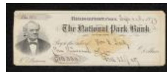
Check: Check from The National Park Bank of New York with image of P.T. Barnum, 1879 (EL 1988.019.001)