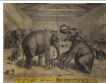
Print: "Interior View of Elephant Building," 1882 (T 2013.042.001)