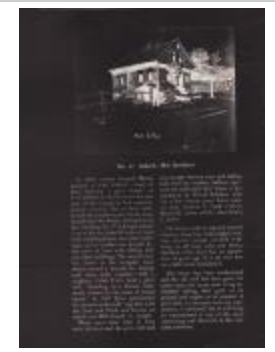
Safford's Mill Residence (Photographs Fold. 010 Photo 18.43)