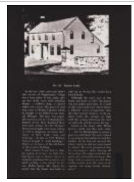
Erastus Avery (Photographs Fold. 010 Photo 18.66)