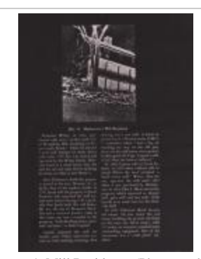
Mathewson's Mill Residence (Photographs Fold. 010 Photo 18.76)