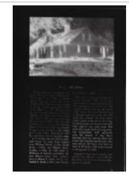
John Stanton (Photographs Fold. 010 Photo 18.45)