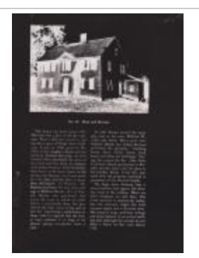
Mott and Downer (Photographs Fold. 010 Photo 18.58)