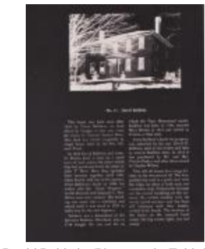
David Baldwin (Photographs Fold. 010)