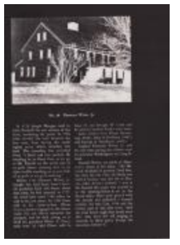
Ebenezer Witter Jr. (Photographs Fold. 010 Photo 18.38)