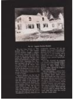
Captain Gurdon Kimball (Photographs Fold. 010 Photo 18.65)

\begin{tabular}{ll} Whipple-Gallup Homestead (Photographs Fold. \\ 010 Photo 18.64) \end{tabular}