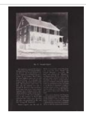
Samuel Capron (Photographs Fold. 010 Photo 18.73)