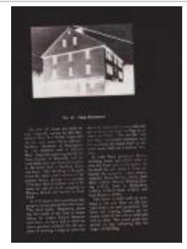
Treat Homestead (Photographs Fold. 010 Photo 18.15)