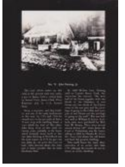
John Deming Jr. (Photographs Fold. 010 Photo 18.79)