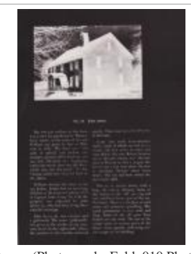
John Avery (Photographs Fold. 010 Photo 18.35)