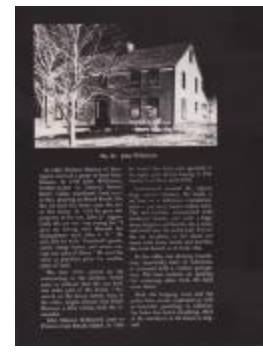
John Wilkinson (Photographs Fold. 010 Photo 18.44)