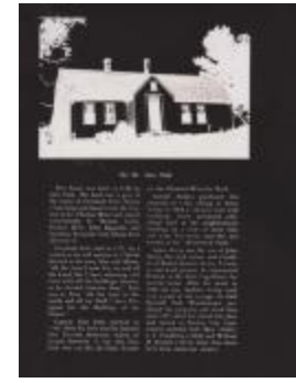
Silas Park (Photographs Fold. 010 Photo 18.80)

John Morgan Place (Photographs Fold. 010 Photo 18.81)