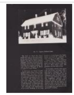
Captain William Grant (Photographs Fold. 010 Photo 18.75)