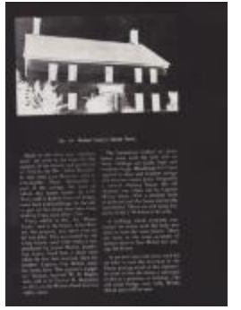
Robert Crary's Home Farm (Photographs Fold. 010 Photo 18.18)