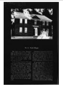
Daniel Morgan (Photographs Fold. 010 Photo 18.23)