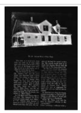
Samuel Mott's Other Place (Photographs Fold. 010 Photo 18.60)