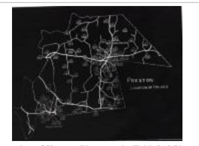
Location of Homes (Photographs Fold. 010 Photo 18)