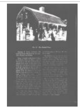
The Haskell Place (Photographs Fold. 010 Photo 18.55)