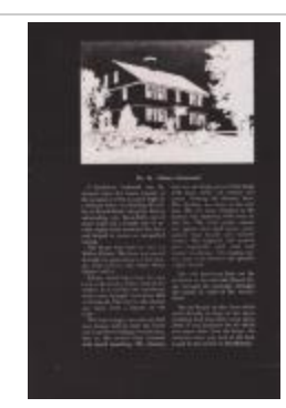
Palmer Homestead (Photographs Fold. 010 Photo 18.49)