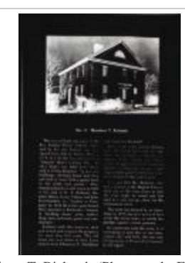
Mundator T. Richards (Photographs Fold. 010 Photo 18.13)