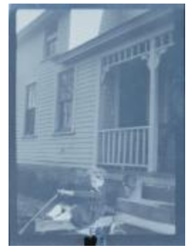
Child in a wagon (Photographs Fold. 009 Photo 163)

Information for Accession p-1.1-31 Negives to Preston in Review publisxhed 1971 (Coll. 001 Fold. 018 Doc. 019)