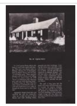
Cyprian Sterry (Photographs Fold. 010 Photo 18.40)