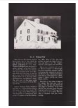
William Pride (Photographs Fold. 010 Photo 18.33)