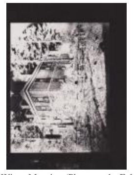
Jonah Witter Mansion (Photographs Fold. 010 Photo 18.1)