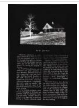
John Ford (Photographs Fold. 010 Photo 18.52)