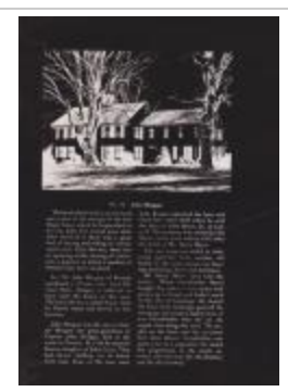
John Morgan (Photographs Fold. 010 Photo 18.62)