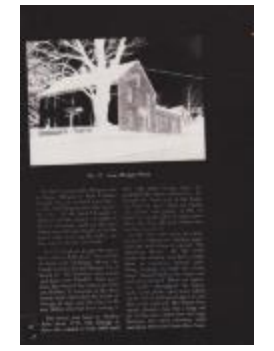
Isaac Morgan Place (Photographs Fold. 010 Photo 18.22)

John Meech (Photographs Fold. 010 Photo 18.21)