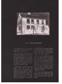
The Grant Homestead (Photographs Fold. 010 Photo 18.53)