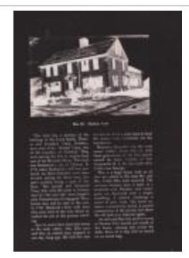
Nathan Ayer (Photographs Fold. 010 Photo 18.50)