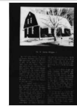
Samuel Whipple Jr. (Photographs Fold. 010 Photo 18.78)