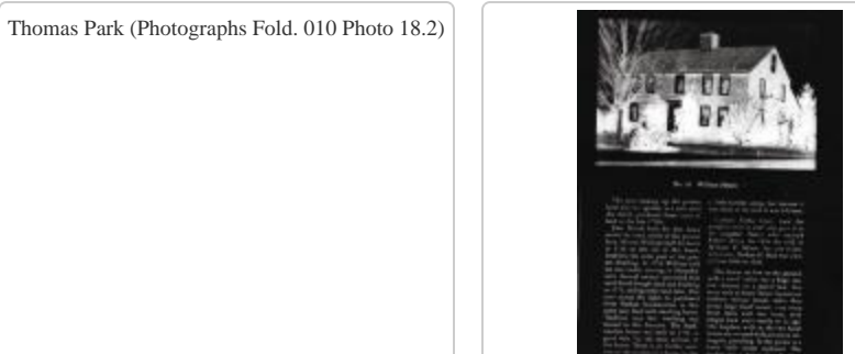
William Meech (Photographs Fold. 010 Photo 18.20)

John Meech (Photographs Fold. 010 Photo 18.21)