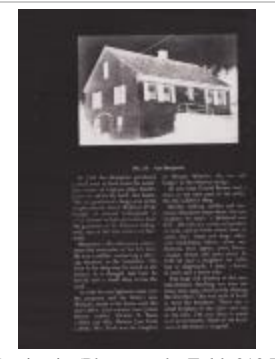
Asa Benjamin (Photographs Fold. 010 Photo 18.34)