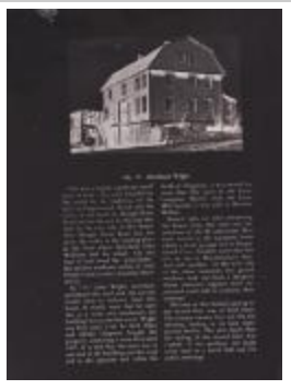
Merchant Wight (Photographs Fold. 010 Photo 18.72)