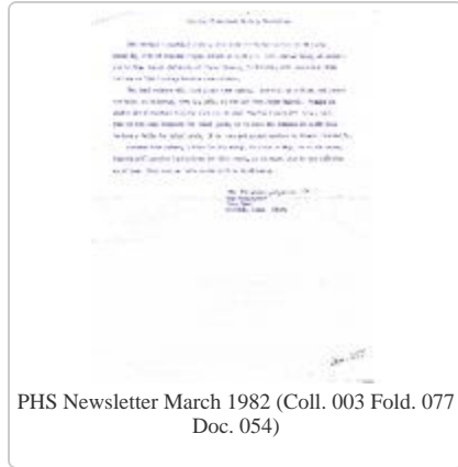
PHS Newsletter March 1982 (Coll. 003 Fold. 077 Doc. 054)