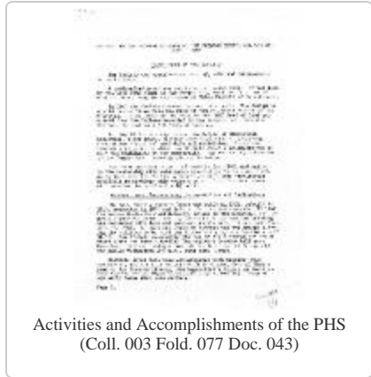
Activities and Accomplishments of the PHS (Coll. 003 Fold. 077 Doc. 043)