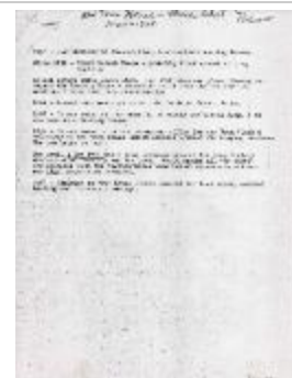
Town Hall Background (Coll. 003 Fold. 068 Doc. 006)