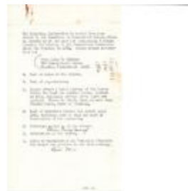
Preston City Congregational Church Response to Committee on Connecticut Congregational History - November 1965 (Coll. 003 Fold. 063)