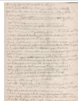
M. Hall Notes on current Long Society Meeting House Structure (Coll. 003 Fold. 068 Doc. 011)