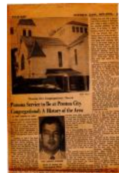
Pomona Service to Be at Preston City Congregational; A History of the Area (Coll. 003 Fold. 063 Doc. 022)