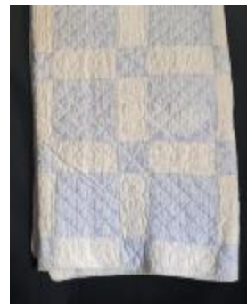
Textiles, Quilts - Blue and White Scranton Quilt (2017.014)