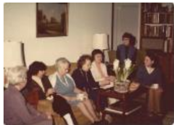
Preston Quilt - Group of participants (Coll. 001 Fold. 008 Photo 001)

They're Telling Town's Tale by Sewing 35-Square Quilt (Coll. 001 Fold. 008 Doc. 016)