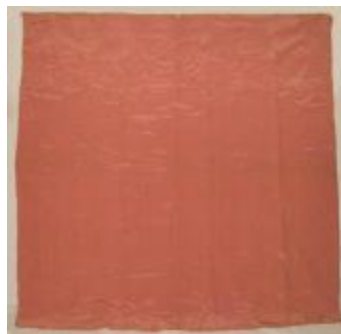
Wholecloth Quilt (1995.102.1)