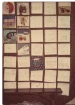
Preston Quilt Plan Layout (Coll. 001 Fold. 008 Photo 002)