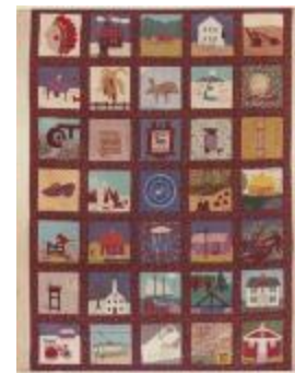
Finished Preston Quilt (Coll. 001 Fold. 008 Photo 003)

Bicentennial Unit plans colonial Fair (Coll. 002 Fold. 010 Doc. 003)