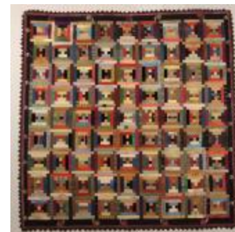
Pieced Quilt (1995.104)