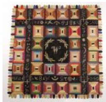
Pieced Quilt (1995.103)