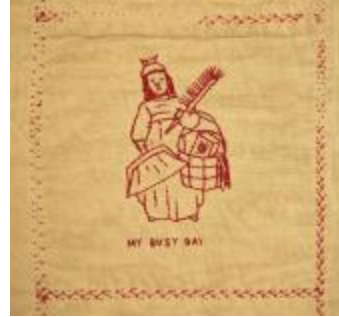
Bed Quilt with red embroidered images (85.4)