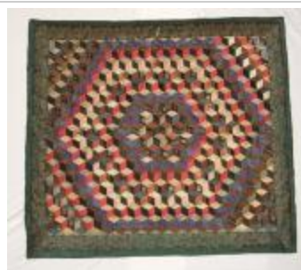
Pieced Quilt (1995.108)