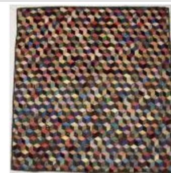
Pieced Quilt (1995.109)