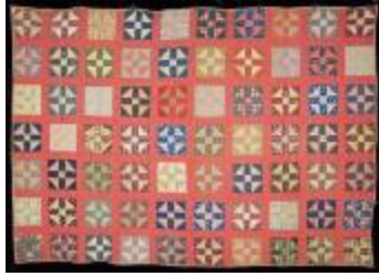
Bed Quilt, Textile - Multicolored Shoo Fly Quilt (76.9.1)