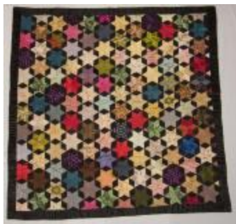
Pieced Quilt (1996.10)