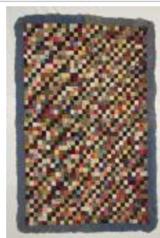
Pieced Quilt (1995.107)