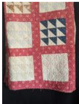
Textiles, Quilts - Red Scranton Quilt (2017.013)