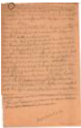
Venerable Soc. for the Propagation of the Gospel in Foreign Parts (Coll. 003 Fold. 060 Doc. 012)