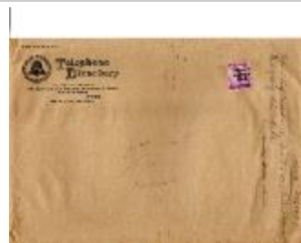
Rebuilding Long Society Church - 1817 & old papers (Coll. 003 Fold. 068 Doc. 001)