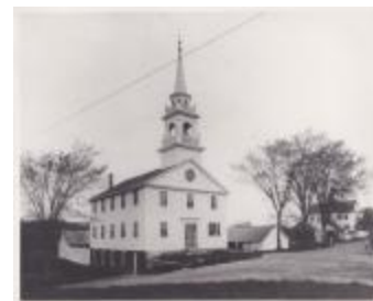
Preston City Baptist Church (Photographs Fold. 004 Photo 102)