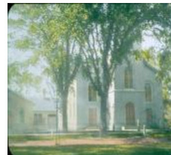
First Church Congregational (MOW_017_First Church_Front)