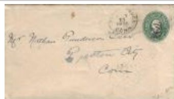
Envelope postmarked 1901 containing picture of St. James Church (Coll. 003 Fold. 064 Doc. 006)