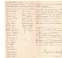
On the back of an old will of Jonah Witter's dated 1797 (Coll. 003 Fold. 060 Doc. 011)