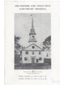
Preston City Baptist Church 125th Anniversary Program (Coll. 003 Fold. 054 Doc. 001)