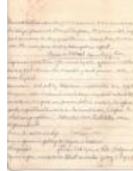
Various Notes on Church History in New England (Coll. 003 Fold. 060 Doc. 010)