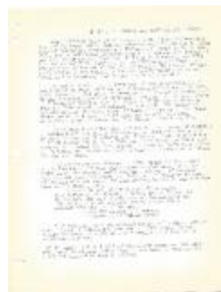
#113 Long Society and Long Society Church