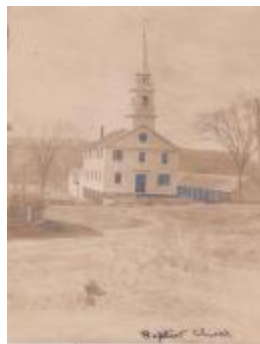
Baptist Church (Photographs Fold. 004 Photo 096)