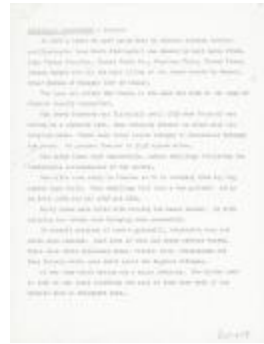
Historical Background - Preston (Coll. 002 Fold. 026 Doc. 009)