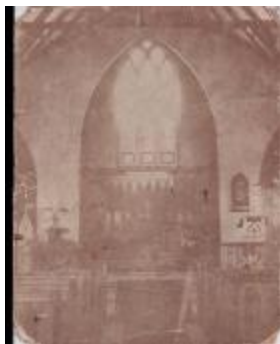
St. James Episcopal Church, Poquetanuck (interior) (undated) (Photographs Fold. 007 Photo 146)