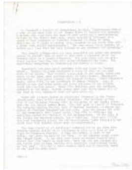
Poquetanuck (Coll. 002 Fold. 026 Doc. 003)