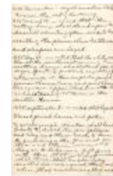
M. Hall's Notes on Congregational Church History pg. 7 (Coll. 003 Fold. 063 Doc. 007)