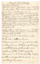
M. Hall's Notes on Congregational Church History pg. 11 (Coll. 003 Fold. 063 Doc. 011)