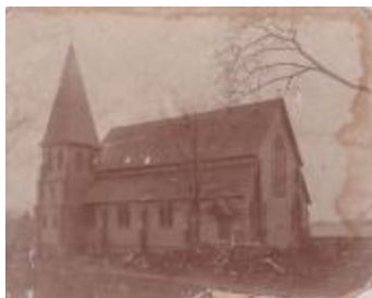
St. James Episcopal Church (exterior) (undated) (Photographs Fold. 007 Photo 145)