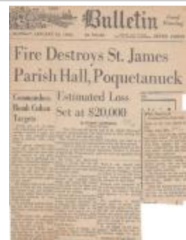
Fire Destroys St. James Parish Hall, Poquetanuck (Coll. 002 Fold. 022 Doc. 011)

Photocopy of Two-Hundred Fiftieth Anniversary 1698 - 1948 of the Congregational Church at Preston City, Connecticut (Coll. 002 Fold. 022 Doc. 010)