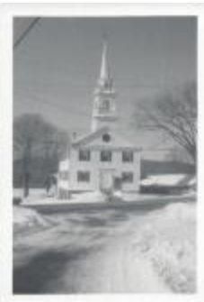
Baptist Church Preston City, CT (Coll. 001 Fold 007 Photo 005)

Preston City Looking North from road (Coll. 001 Fold 007 Photo 008)