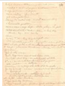
M. Hall Notes on Early Meeting Houses (Coll. 003 Fold. 063 Doc. 023)