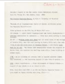
Records & Papers of the New London County Historical Society Part II, Volume II - New London, Conn. 1896 (Coll. 002 Fold. 022 Doc. 012)