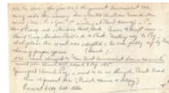
Society of United Christian Friends in the Towns of Norwich, Preston, and Groton (Coll. 003 Fold. 064 Doc. 002)