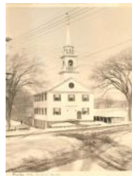
Preston City Baptist Church (Coll. 003 Vol. 015 Photo 013a)