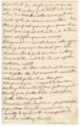
M. Hall's Notes on Congregational Church History pg. 6 (Coll. 003 Fold. 063 Doc. 006)