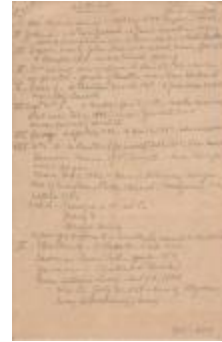
Loring (Coll. 003 Fold. 053 Doc. 009)