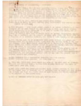
Volume III Colonial Records of Connecticut ---- 1678-1689 (Coll. 003 Fold. 062 Doc. 001)