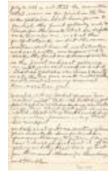
M. Hall's Notes on Congregational Church History pg. 8 (Coll. 003 Fold. 063 Doc. 008)