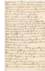
M. Hall's Notes on Congregational Church History pg. 1 (Coll. 003 Fold. 063 Doc. 001)