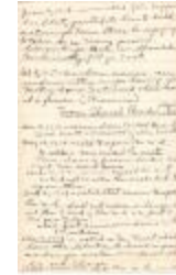
M. Hall's Notes on Congregational Church History pg. 9 (Coll. 003 Fold. 063 Doc. 009)