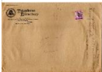
Rebuilding Long Society Church - 1817 & old papers (Coll. 003 Fold. 068 Doc. 001)