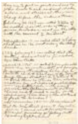
M. Hall's Notes on Congregational Church History pg. 10 (Coll. 003 Fold. 063 Doc. 010)