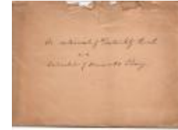
Bi-centennial of Preston City Church and Dedication of Monument & Library (Coll. 003 Fold. 060 Doc. 001)