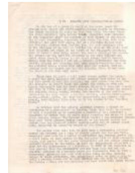
#69 Preston City Congregational Church (Coll. 003 Fold. 063 Doc. 020)