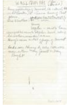
Wallbridge (Coll. 003 Fold. 053 Doc. 007)

Eliashib Adams of Preston (Coll. 003 Fold. 053 Doc. 005)