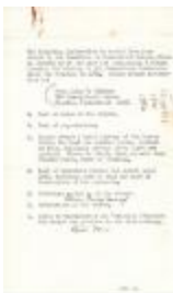
Preston City Congregational Church Response to Committee on Connecticut Congregational History - November 1965 (Coll. 003 Fold. 063)