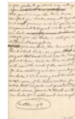
M. Hall's Notes on Congregational Church History pg. 5 (Coll. 003 Fold. 063 Doc. 005)