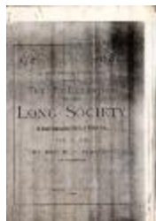
Copy of A Historic Discourse delivered at The Re-Dedication of the Long Society or Second Congregational Church, Preston, Conn. (Coll. 003 Fold. 068 Doc. 002)