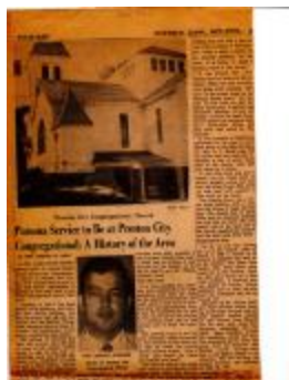
Pomona Service to Be at Preston City Congregational: A History of the Area (Coll. 003 Fold. 063 Doc. 022)