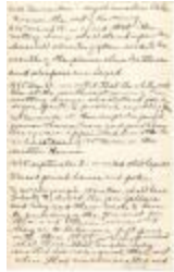
M. Hall's Notes on Congregational Church History pg. 7 (Coll. 003 Fold. 063 Doc. 007)