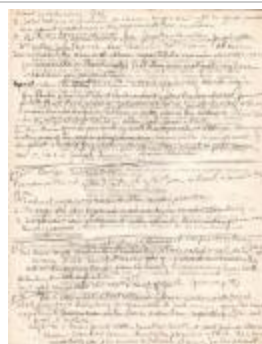
A Book of Record for the First Church in Preston Transcripts pg. 7 (Coll. 003 Fold. 061 Doc. 007)