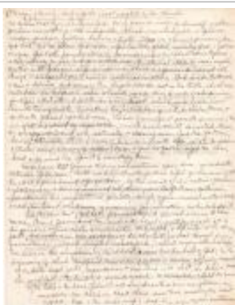
A Book of Record for the First Church in Preston Transcripts pg. 5 (Coll. 003 Fold. 061 Doc. 005)