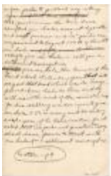
M. Hall's Notes on Congregational Church History pg. 5 (Coll. 003 Fold. 063 Doc. 005)