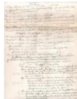
A Book of Record for the First Church in Preston Transcripts pg. 34 (Coll. 003 Fold. 061 Doc. 018)