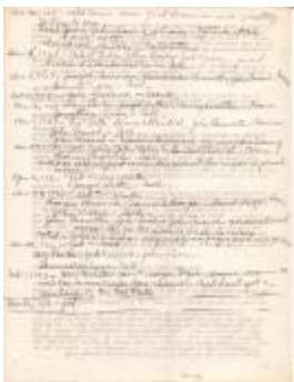
A Book of Record for the First Church in Preston Transcripts pg. 13 (Coll. 003 Fold. 061 Doc. 013)