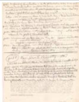
A Book of Record for the First Church in Preston Transcripts pg. 10 (Coll. 003 Fold. 061 Doc. 010)