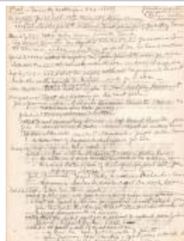
A Book of Record for the First Church in Preston Transcripts pg. 11 (Coll. 003 Fold. 061 Doc. 011)