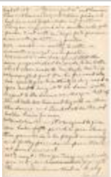
M. Hall's Notes on Congregational Church History pg. 1 (Coll. 003 Fold. 063 Doc. 001)