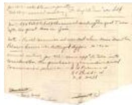
M. Hall's Notes on 20th Century Congregational Church History Fragment (Coll. 003 Fold. 063 Doc. 014)