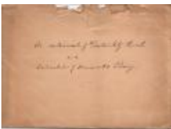
Bi-centennial of Preston City Church and Dedication of Monument & Library (Coll. 003 Fold. 060 Doc. 001)