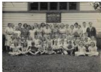
Preston City Congregational Church Sunday School group (Photographs Fold. 001 Photo 031)