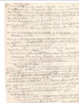
A Book of Record for the First Church in Preston Transcripts pg. 8 (Coll. 003 Fold. 061 Doc. 008)