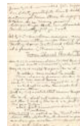
M. Hall's Notes on Congregational Church History pg. 9 (Coll. 003 Fold. 063 Doc. 009)