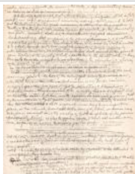
A Book of Record for the First Church in Preston Transcripts pg. 6 (Coll. 003 Fold. 061 Doc. 006)