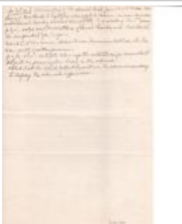
A Book of Record for the First Church in Preston Transcripts pg. 9 (Coll. 003 Fold. 061 Doc. 009)