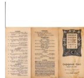
Christian Endeavor Prayer Meeting Topics 1910, Congregational Church, Preston City (Coll. 003 Fold. 063 Doc. 035)