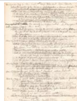
A Book of Record for the First Church in Preston Transcripts pg. 12 (Coll. 003 Fold. 061 Doc. 012)