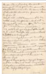
M. Hall's Notes on Congregational Church History pg. 2 (Coll. 003 Fold. 063 Doc. 002)