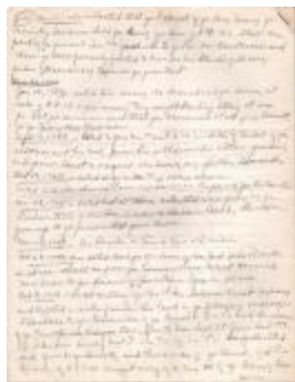
A Book of Record for the First Church in Preston Transcripts pg. 16-32 (Coll. 003 Fold. 061 Doc. 016)