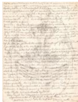
A Book of Record for the First Church in Preston Transcripts pg. 3 (Coll. 003 Fold. 061 Doc. 003)