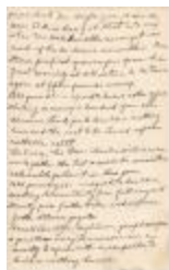
M. Hall's Notes on Congregational Church History pg. 6 (Coll. 003 Fold. 063 Doc. 006)