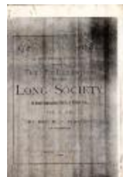
Copy of A Historic Discourse delivered at The Re-Dedication of the Long Society or Second Congregational Church, Preston, Conn. (Coll. 003 Fold. 068 Doc. 002)