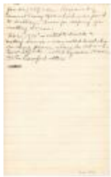
M. Hall's Notes on Congregational Church History pg. 12 (Coll. 003 Fold. 063 Doc. 012)