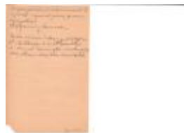
M. Hall's Notes on Extant Meeting Houses (Coll. 003 Fold. 063 Doc. 032)