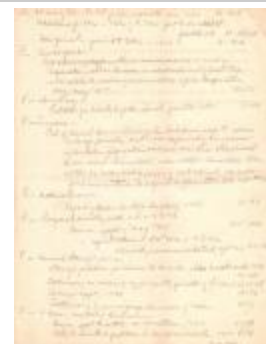
M. Hall's Notes from col. VI of Preston City Congregational Church Records (Coll. 003 Fold. 063 Doc. 025)