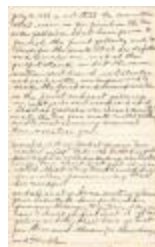
M. Hall's Notes on Congregational Church History pg. 8 (Coll. 003 Fold. 063 Doc. 008)