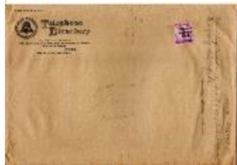
Rebuilding Long Society Church - 1817 & old papers (Coll. 003 Fold. 068 Doc. 001)