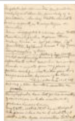
M. Hall's Notes on Congregational Church History pg. 3 (Coll. 003 Fold. 063 Doc. 003)