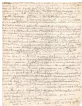
A Book of Record for the First Church in Preston Transcripts pg. 2 (Coll. 003 Fold. 061 Doc. 002)