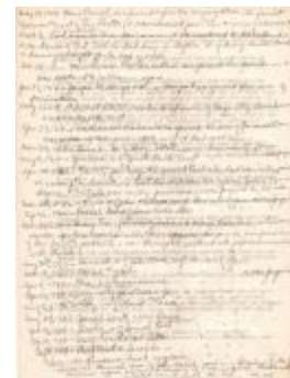
A Book of Record for the First Church in Preston Transcripts pg. 4 (Coll. 003 Fold. 061 Doc. 004)