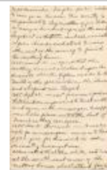
M. Hall's Notes on Congregational Church History pg. 4 (Coll. 003 Fold. 063 Doc. 004)