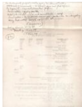
A Book of Record for the First Church in Preston Transcripts pg. 33 (Coll. 003 Fold. 061 Doc. 017)