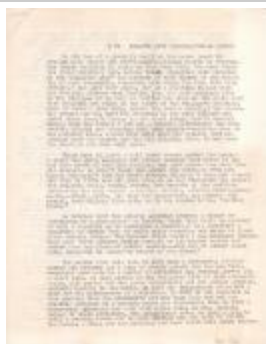
#69 Preston City Congregational Church (Coll. 003 Fold. 063 Doc. 020)