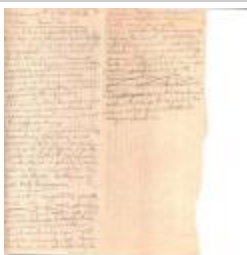
Notes from The Achievement of Religious Liberty in Connecticut (Coll. 003 Fold. 060 Doc. 013)