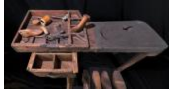
Furniture, Tools - Cobbler's Bench (79.705)