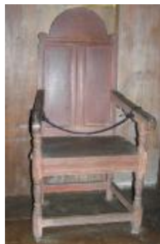
Leete Chair (HW1902.061)