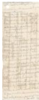
Notes from "Settlement of Connecticut Towns" (Coll. 003 Fold. 046 Doc. 004)