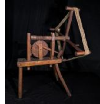
Household - Yarn Winder w counter (79.711)