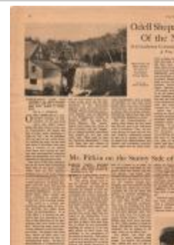
Odell Shepard's Salty Study of the Nutmeg State (Coll. 003 Fold. 073 Doc. 025)