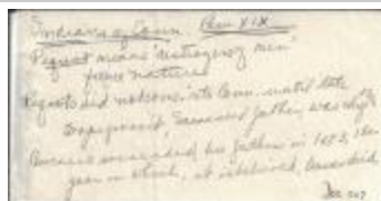
Pequots from "Indians of Connecticut" (Coll. 003 Fold. 066 Doc. 007)