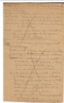
Indians of Connecticut - John W. DeForest 1852 (Coll. 003 Fold. 066 Doc. 012)