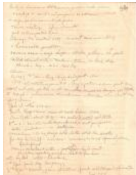
M. Hall Notes on Early Meeting Houses (Coll. 003 Fold. 063 Doc. 023)