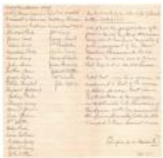
On the back of an old will of Jonah Witter's dated 1797 (Coll. 003 Fold. 060 Doc. 011)