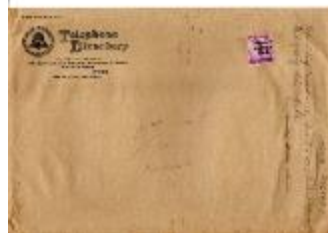
Rebuilding Long Society Church - 1817 & old papers (Coll. 003 Fold. 068 Doc. 001)