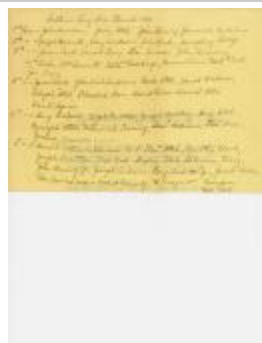
Seats in Long Society Church 1760 (Coll. 003 Fold. 068 Doc. 005)