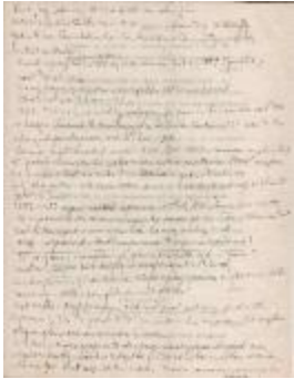
M. Hall Notes on current Long Society Meeting House Structure (Coll. 003 Fold. 068 Doc. 011)