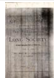
Copy of A Historic Discourse delivered at The Re-Dedication of the Long Society or Second Congregational Church, Preston, Conn. (Coll. 003 Fold. 068 Doc. 002)