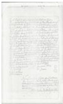
Photocopy of Benj. and Fear Stanton Deed (Coll. 002 Fold. 008 Doc. 018)