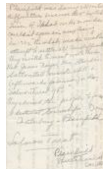
Plainfield Bicentennial - note referring to Salmon Treat (Coll. 003 Fold. 046 Doc. 002)