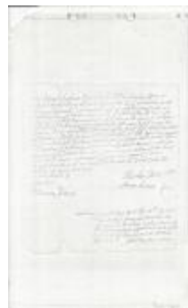
Photocopy of Parker Adams Deed 1751 (Coll. 002 Fold. 008 Doc. 022)