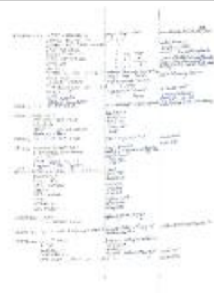
Church Membership - Preston City Congregational Church 1697 - 1976 (Coll. 003 Fold. 059 Doc. 002)