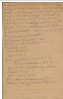
Highway Survey in accordance with a Memorial of Capt. Silas Park (Coll. 003 Fold. 065 Doc. 004)