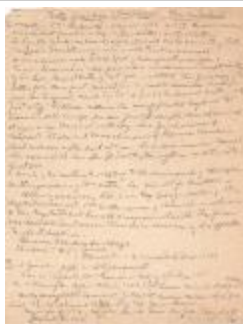
Notes from Witter Genealogy by Washburn (Coll. 003 Fold. 051 Doc. 005)