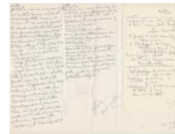
Notes on Witter Genealogy (Coll. 003 Fold. 051 Doc. 002)